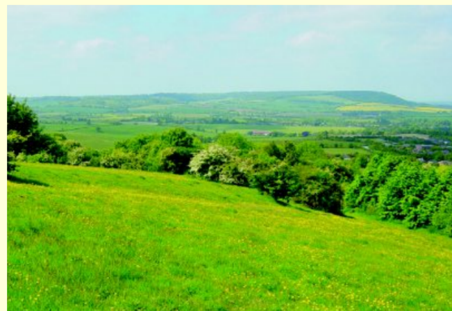
Overlooking Princes Risborough - View from Brush Hill

The rides will take you through the countryside around Princes Risborough within a radius of 5 miles (8km). Mountain bikes are recommended but some of the rides can be made on ordinary road bikes. Each ride has a distance, grading and time applied, but these are only approximate. It is recommended that cyclists carry the appropriate Ordnance Survey Explorer Maps. The conditions of the pathways and trails may vary depending on the weather and time of year.