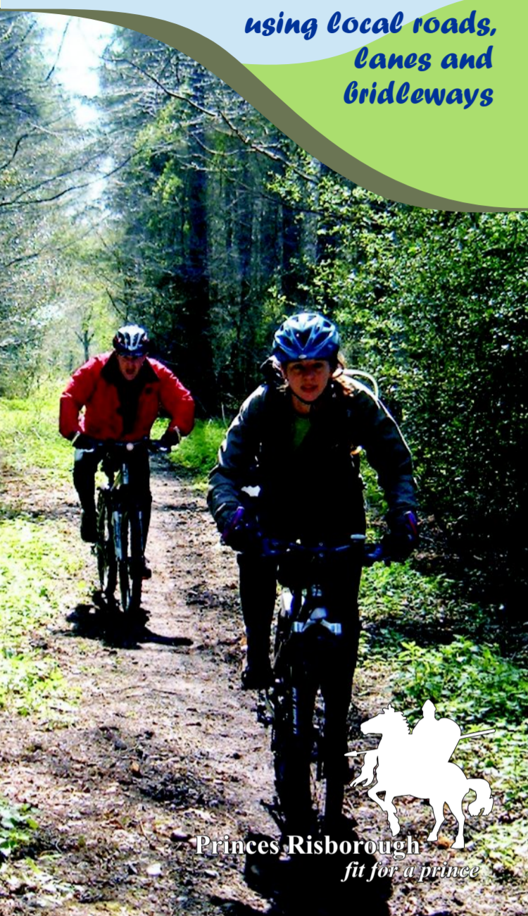
Princes Risborough fit for a prince