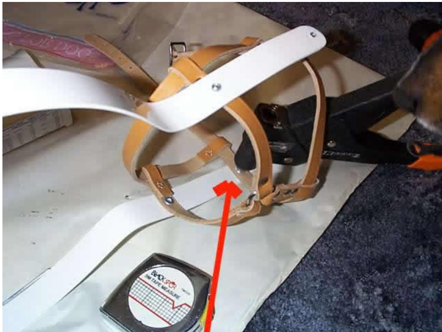
The blind dog hoop harness is complete. Give your dog a little time to adjust to it. He may be a little confused at first.