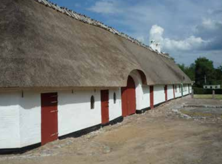
The buildings towards west and north contains all the barns for grain and threshing floor.

The farmhouse and the rest of the southern part of the building - up to the gate passage - seem to be built simultaneously of new materials. While the western part appears to be built from recycled materials. These may have been reused from a former building – from before the buildings were merged into one, where the barn to the north now forms the "hook".