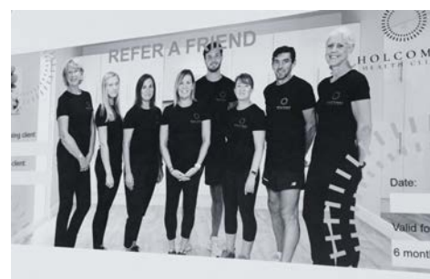
Refer a friend vouchers