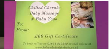
Baby massage & baby yoga vouchers

We have a range of vouchers, resistance bands, rollers and massage balls of different shapes and sizes; all ideal as Christmas presents or stocking fillers.