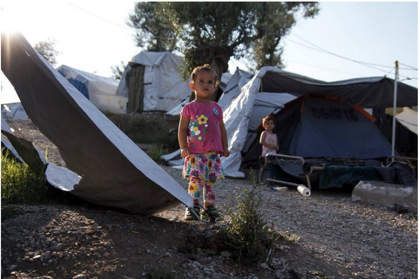
Children are exposed to hunger, sickness and potential abuse in the camp.