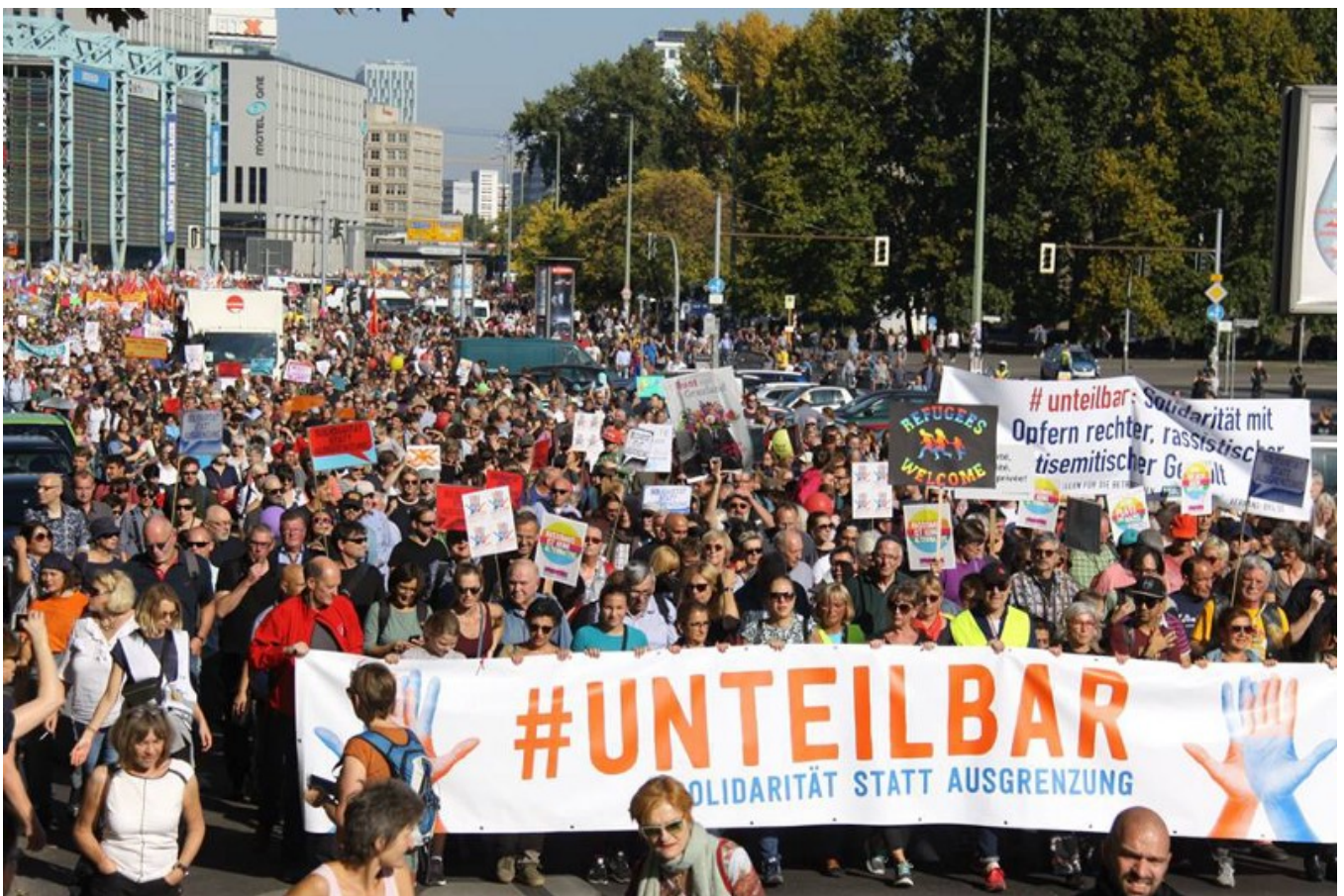
"Refugees welcome" was one of the most common banners in the protest.

Approximately 242,000 people took the streets of Berlin following the motto #unteilbar (indivisible) showing solidarity in the fight against