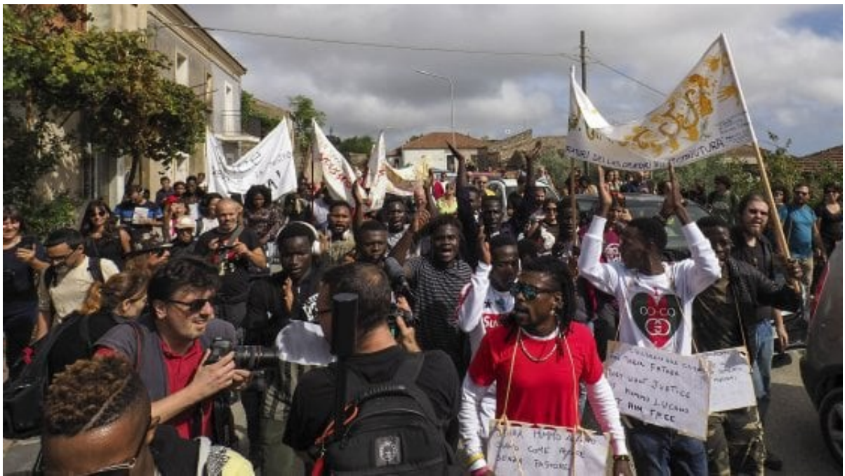
The Riace demonstration in support of Mayor Lucano after his arrest.

The Riace model has been widely recognised as a good example of integration of refugees in Italian society. The mayor claims no wrongdoing, and many see his house arrest as a warning against providing additional support to refugees in Italy. The president of Calabria Region Mario Oliverio has publicly asked Deputy Prime Minister Salvini to revise his decisions against the Riace mayor and to recognise his integration efforts.