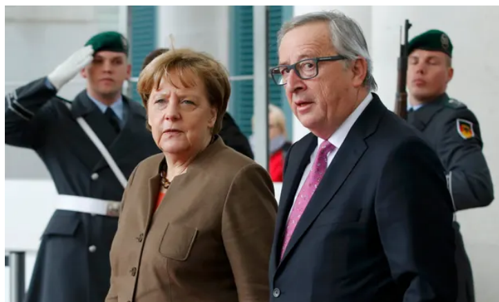
The migration crisis, if not dealt with, threatens to damage the political legacies of Angela Merkel and Jean-Claude Juncker.

Those resisting the pressure from Berlin and Brussels view such alarmism as scare tactics aimed at forcing the opposition to yield. But of the 1.1 million asylum seekers who entered the EU last year, about 90% have ended up in only three countries: Germany, Sweden and Austria.