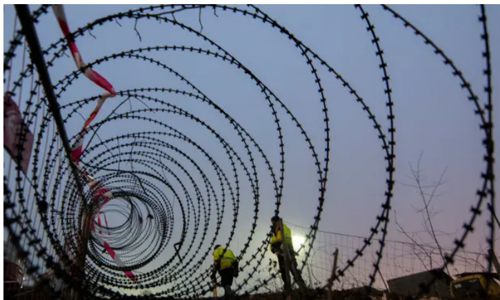
Austrian workers construct a fence at a border crossing between Austria and Slovenia.

And what of Britain? The proposed timetable for the asylum policy overhaul also complicates David Cameron's bid to secure a new European deal keeping the UK in the EU as a result of a referendum, probably by early summer. This is less because of the numbers involved, which are small, than because of the toxicity of the migration issue and its centrality to the referendum campaign.