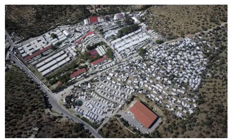
An aerial view of Moria refugee camp.

When he reached Moria he slept rough outside the main gates for 22 days, waiting for a tent. When it started to rain he clubbed together with 12 friends to buy a four-bunk hut built out of scrap wood from another Afghan man who was leaving. It cost €300 and they paid an extra €100 for electricity. Theirs is one of thousands of cables that over the last two months have festooned the tents and lean-tos around the fenced camp.