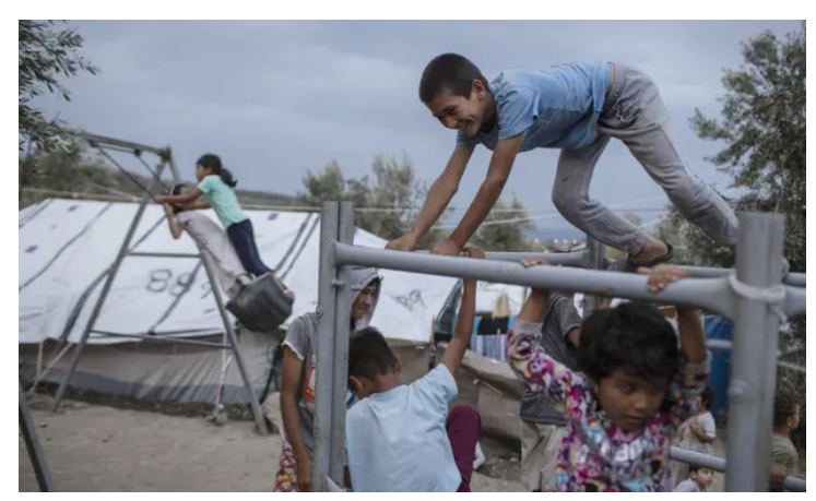
Children at a makeshift camp outside Moria. Around 13,000 people — more than four times the site's capacity — are currently housed there.

Moria is the unwilling centrepiece of a bargain the EU struck with Turkey in 2016 at the height of refugee arrivals. The deal was meant to curb flows across the Aegean in return for aid money and the relocation of some Syrian refugees from Turkey to Europe. Greece let its islands be used as a buffer zone to prevent all but the most vulnerable new arrivals reaching the mainland and vowed to return the bulk of asylum seekers to Turkey. The containment centred on five "hot spots", including Moria, where asylum seekers would be registered and provided with shelter.