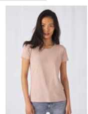
DUO CONCEPT with B&C Inspire T /w.

You like the B&C Inspire T /men but want another weight or style? Try the: * B&C INSPIRE PLUS T /MEN - same style but in a heavier fabric * B&C INSPIRE V T /MEN - same fabric but in short-sleeved V-neck * B&C INSPIRE TANK T /MEN - same fabric but in tank top