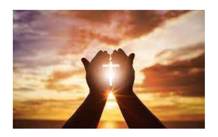
This week we are praying for...

1 Timothy 2. 1-2: I urge you then, first of all, that petitions, prayers and intercession and thanksgiving be made for all people For Kings and all those in authority, that we may live peaceful and quiet lives in all godliness and holiness. This is good and pleases God our Saviour.