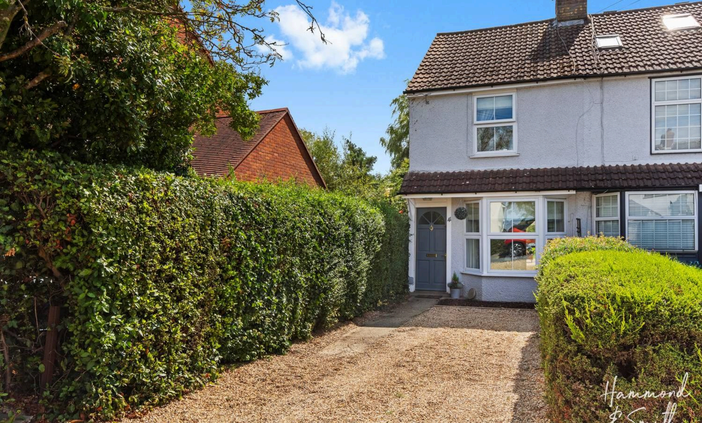
41 Upland Road, Thornwood £425,000