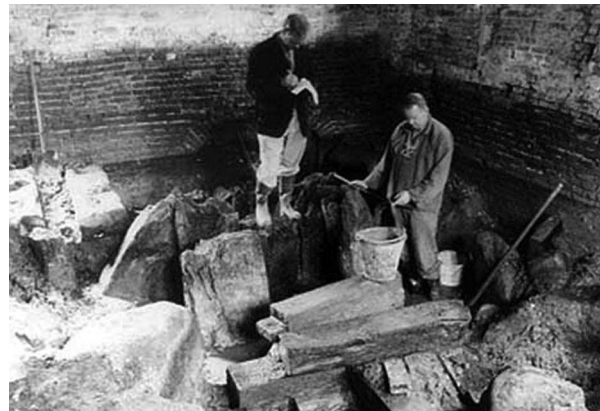
Excavation in the interior of Hammermøllen

Aalsgaard. Hellebæk Estate was owned by the noble families v. Baudissin, v. Löwenstern and Schimmelmann. After WW2 Hellebæk Estate including Hammermøllen was confiscated by the Danish State.