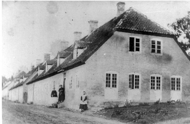
Bøsemagergade (Gunsmith Street). Foto: Louise Thomsen, ca. 1860

Hammermøllen (the Hammer Mill) was an integrated part of the arms works, Kronborg Geværfabrik. The works included 8 water mills, all powered by Hellebækken (the Holy Stream). There were three different types of mill: Hammer mills, drilling mills and grinding mills. All buildings in Hellebæk were used for both habitation and workshops. Kronborg Geværfabrik was closed down in 1870. Subsequently, Hammermøllen was used exclusively for habitation.