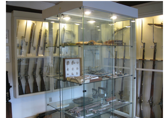
Museum of Hammermøllen

During the excavations remnants of water inlet, paddle wheels and hammerworks were found, making it possible to carry out a reconstruction of both the interior and exterior of the mill.