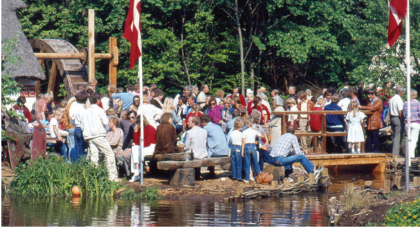
Whitsun Market

After 21 years of work carried out by both voluntary and professional workers, and financially supported by public, as well as private donations, Hammermøllen could be reopened in 1982.