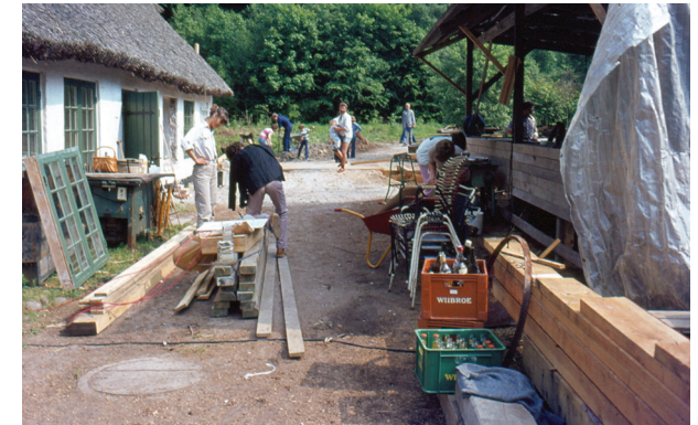
Working day on Hammermøllen restoration. Foto: Svend Engelbrechtsen, 1981

The building deteriorated markedly and in the end of the 1950'ies it was hardly appropriate for habitation. It was planned to demolish the mill. A number of persons with particular interest in the local history carried