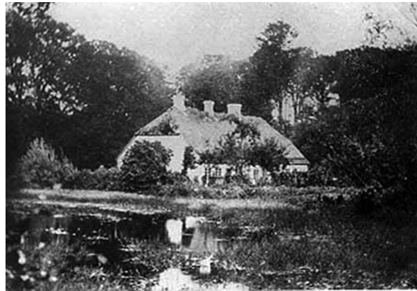
Hammermøllen.