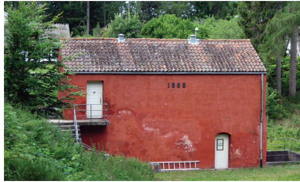
Turbinehuset.

"Theatre Group of Hammermøllen" has since 1988 staged local historic plays on the lawns of Hammermøllen. Every second year in August an enthusiastic audience is invading the area in order to enjoy these very poetic plays.