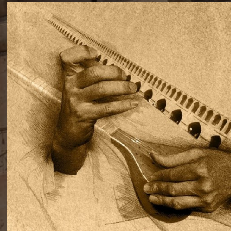
Unspoken Tales of 1001 Nights: A Musical Experience