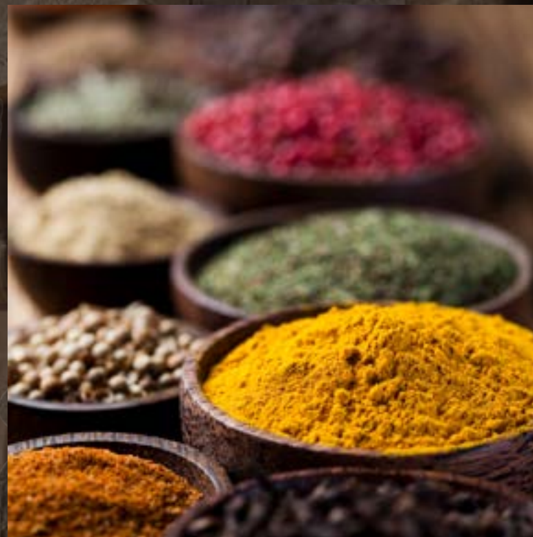
Tastes & Aromas of Aleppo