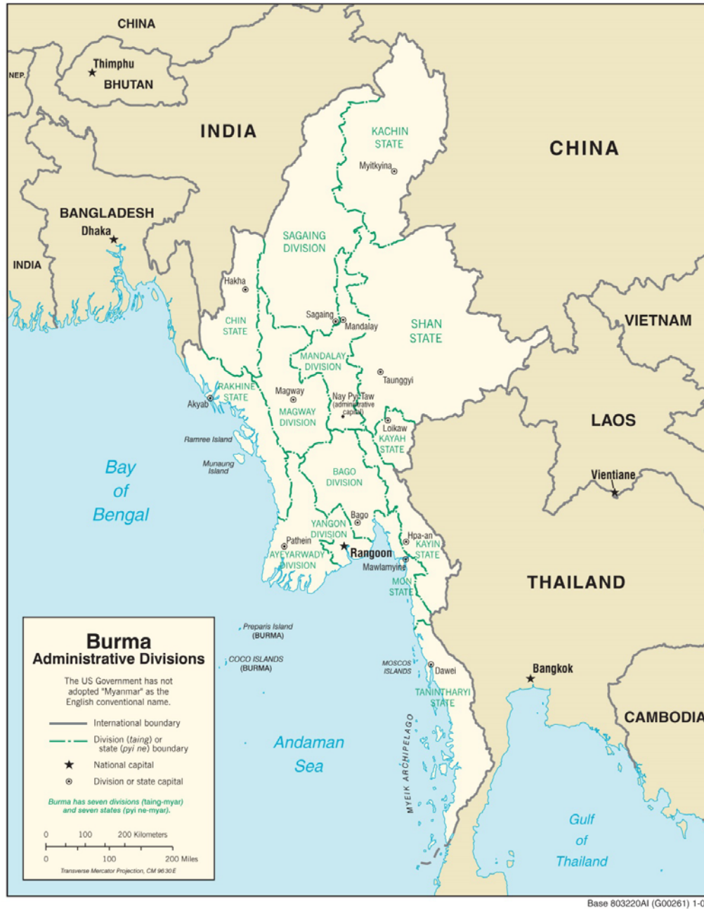
Figure 1: Administrative Map of Myanmar/Burma