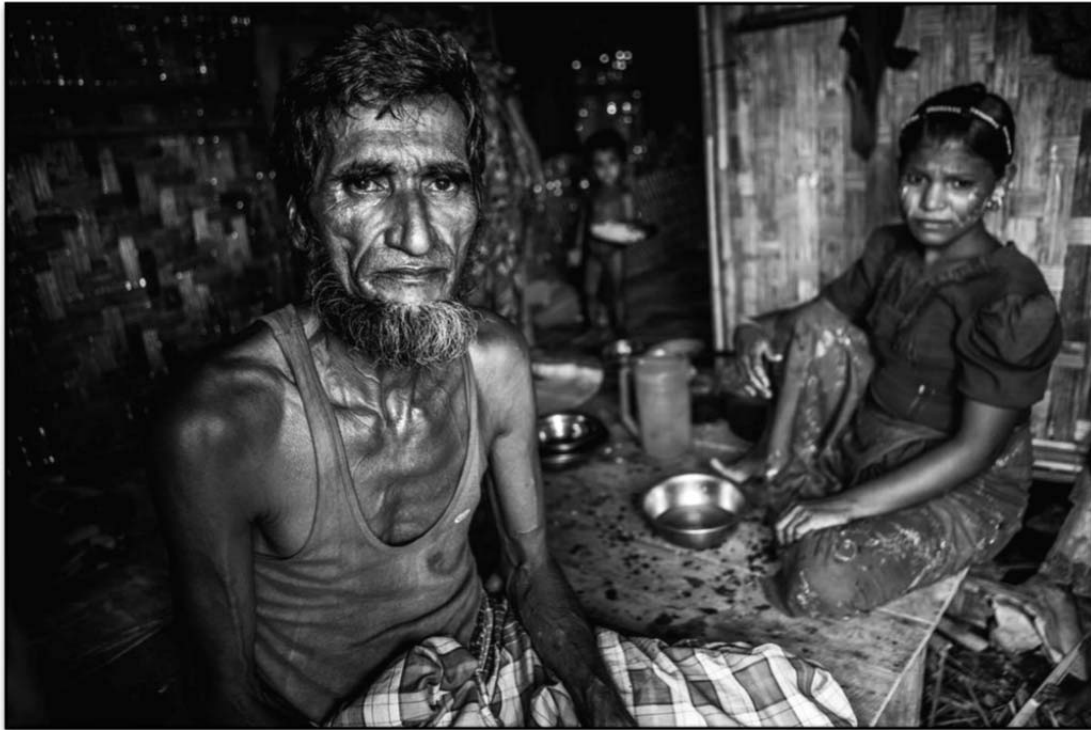
Figure 4: Rohingya Refugees in an Internally Displaced Persons Camp in Sittwe, Myanmar