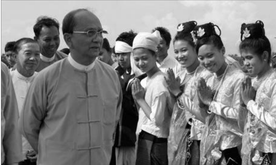
Figure 5: Ethnic Rakhinese Welcome President Thein Sein