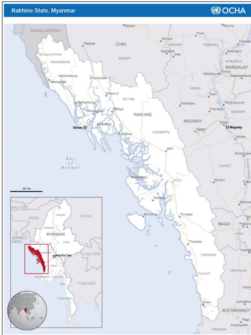
Figure 2: Map of Rakhine State