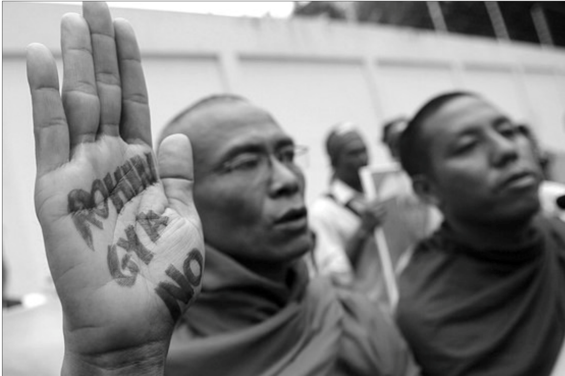
Figure 6: Buddhist Monks Protesting Against the Muslim Rohingya in Myanmar