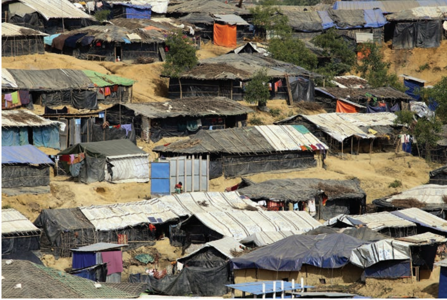
A view of a refugee camp in Cox's Bazar, Bangladesh, for Rohingya people who have fled from the oppression of ongoing military operations in Myanmar's Rakhine State.