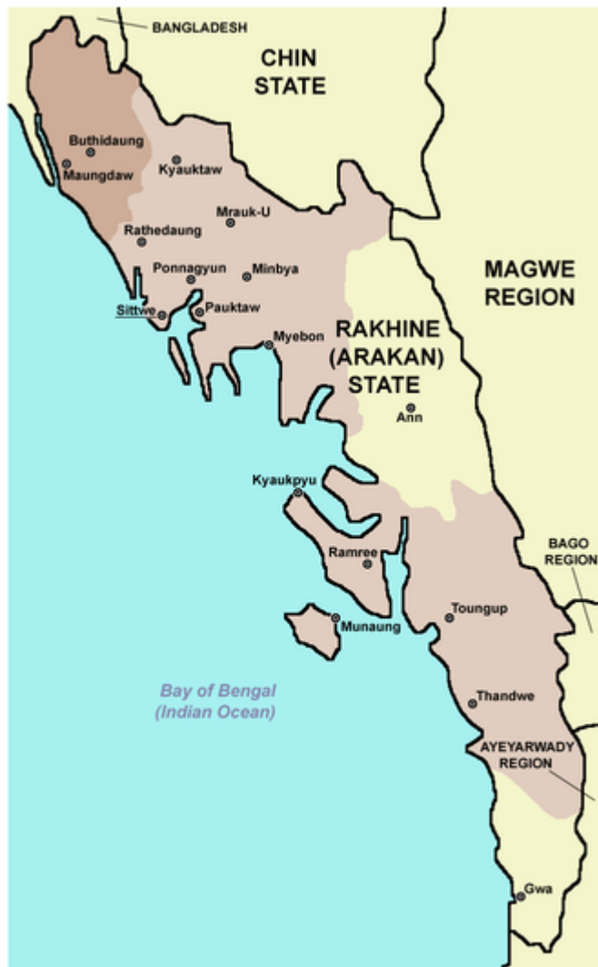
Rohingya people in Rakhine (Arakan) State in Myanmar

This systematic discrimination has periodically escalated to active violence. In 1977, the military launched an operation to register citizens and prosecute illegal immigrants. Mass arrests, violence, and brute force caused over 200,000 Rohingya to flee to Bangladesh. In 1991, operations in Rakhine State picked up once again – this time, under the premise of targeting