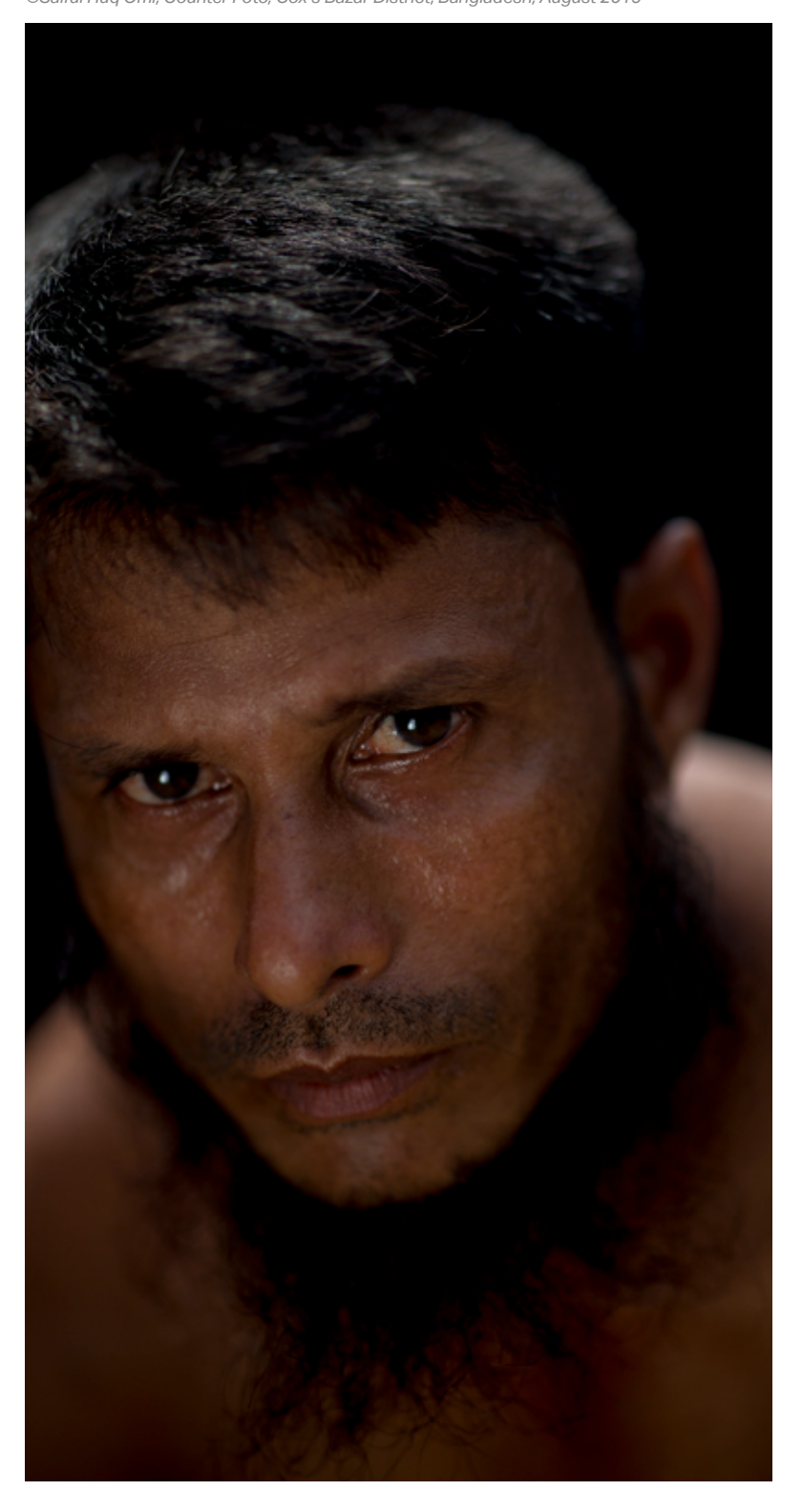
A.R, 30. Cox's Bazar District, Bangladesh, August 2019