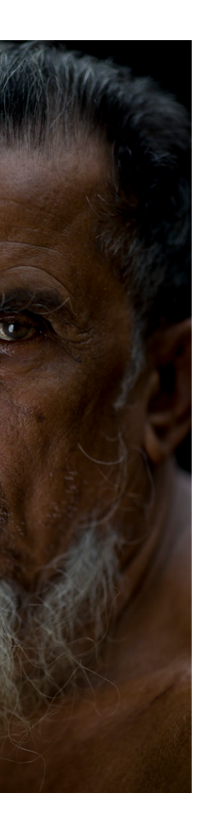
N.B., 25. Cox's Bazar District, Bangladesh, August 2019