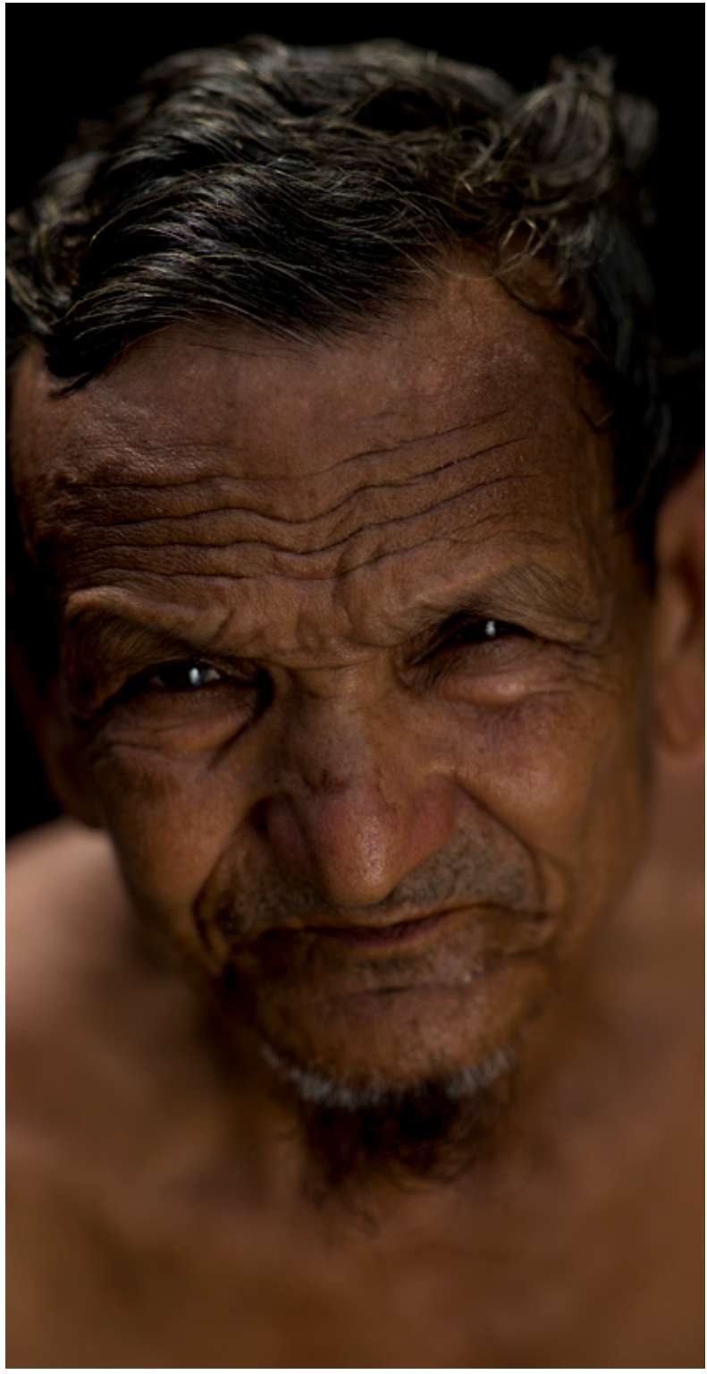
N.M., 75. Cox's Bazar District, Bangladesh, August 2019