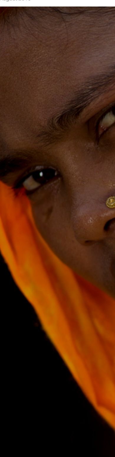
"F.Z.," 25. ©Saiful Huq Omi, Counter Foto, Cox's Bazar District, Bangladesh, August 2019