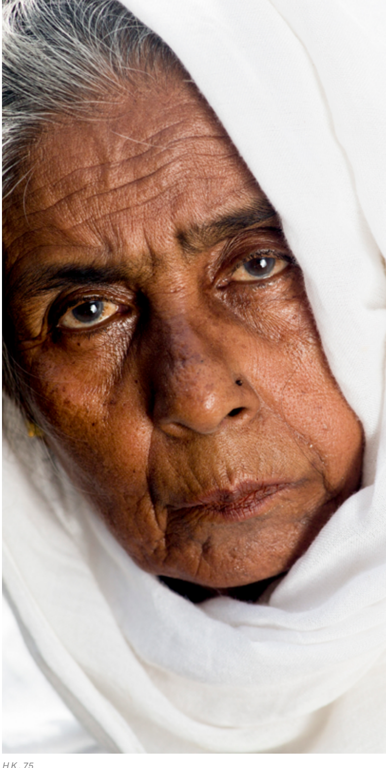
H.K., 75. ©Saiful Huq Omi, Counter Foto, Cox's Bazar District, Bangladesh, August 2019