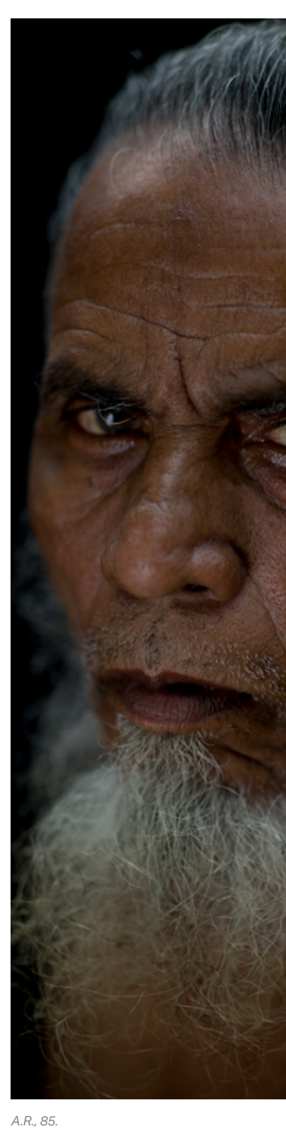
©Saiful Huq Omi, Counter Foto, Cox's Bazar District, Bangladesh, August 2019