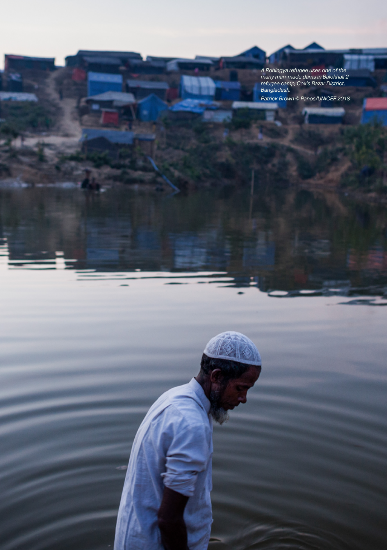
A Rohingya refugee uses one of the many man-made dams in Balokhali 2 refugee camp, Cox's Bazar District, Bangladesh.