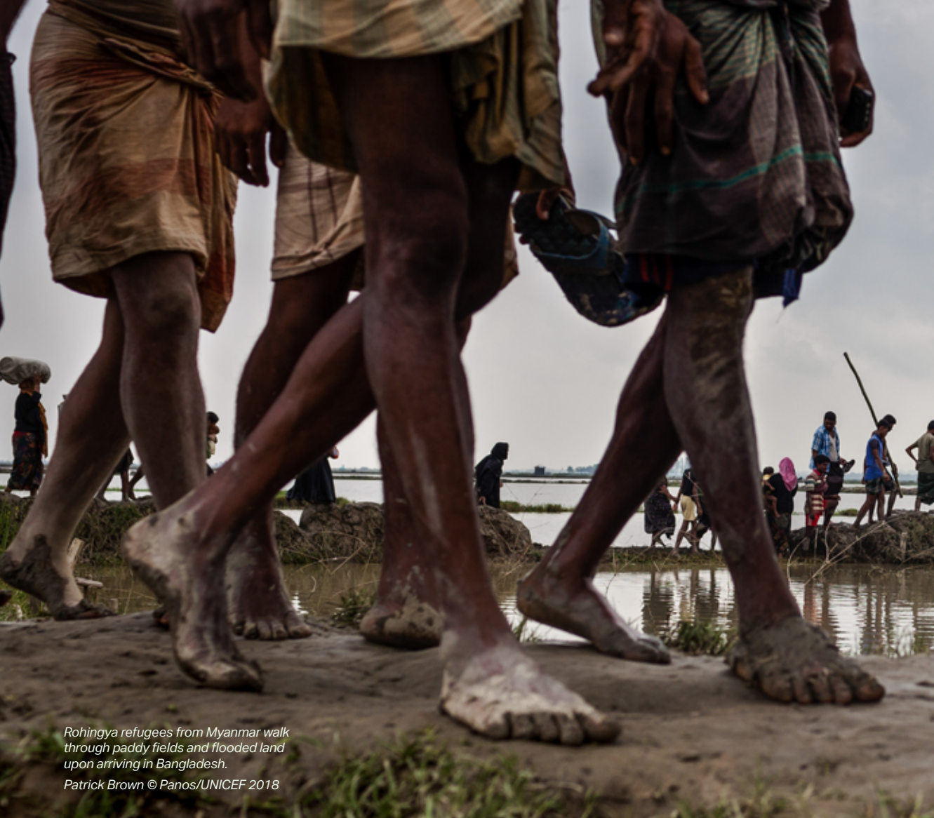
Rohingya refugees from Myanmar walk through paddy fields and flooded land upon arriving in Bangladesh.