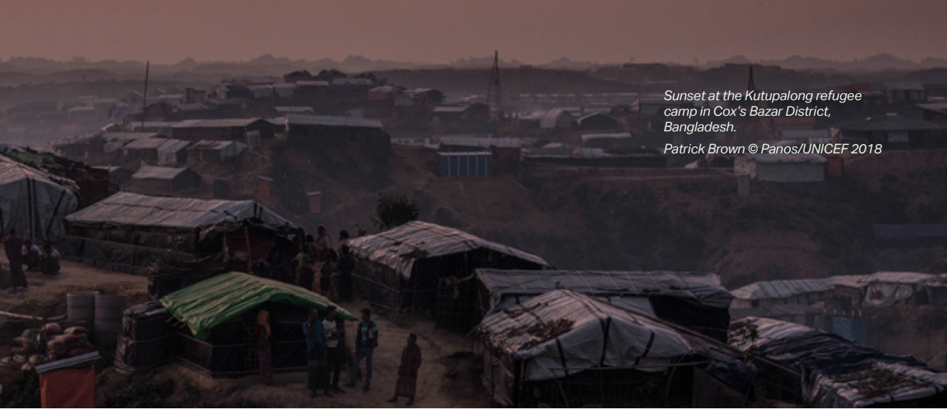
Sunset at the Kutupalong refugee camp in Cox's Bazar District, Bangladesh.