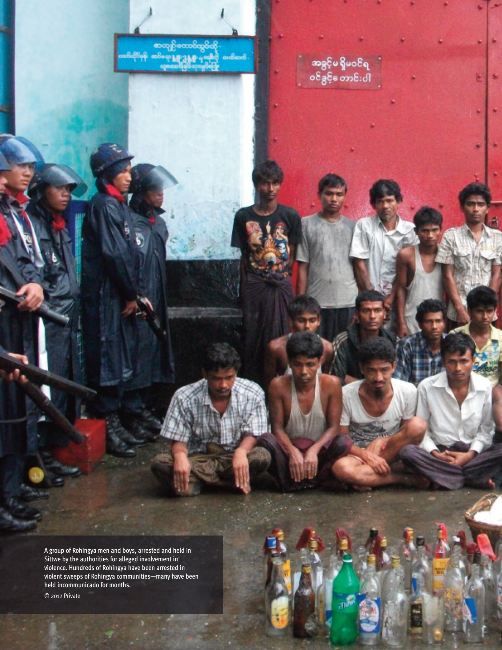
A group of Rohingya men and boys, arrested and held in Sittwe by the authorities for alleged involvement in violence. Hundreds of Rohingya have been arrested in violent sweeps of Rohingya communities—many have been held incommunicado for months.