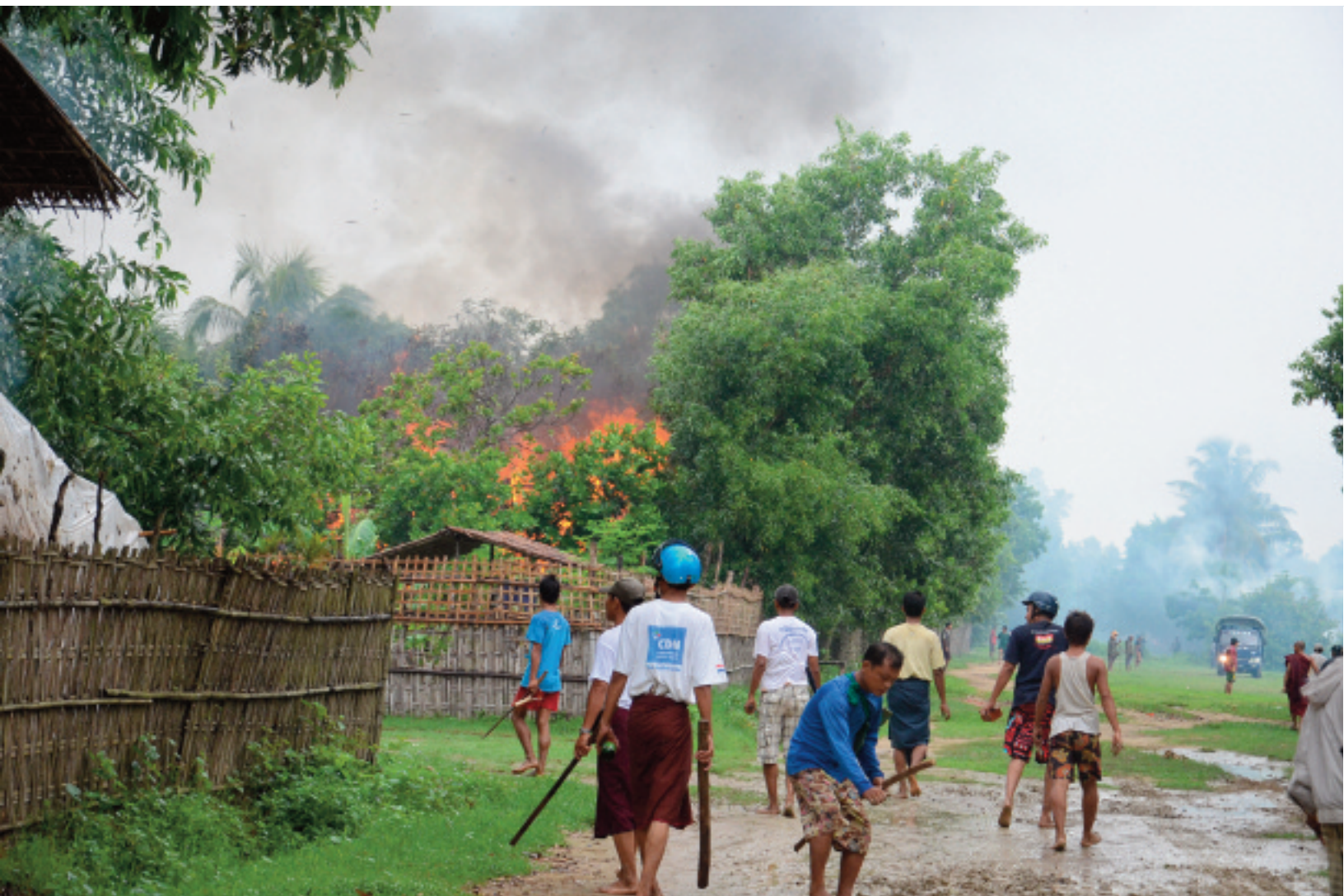
A group of Arakanese with weapons approach a Muslim village already in flames. Sittwe Township, Arakan State, June 2012.