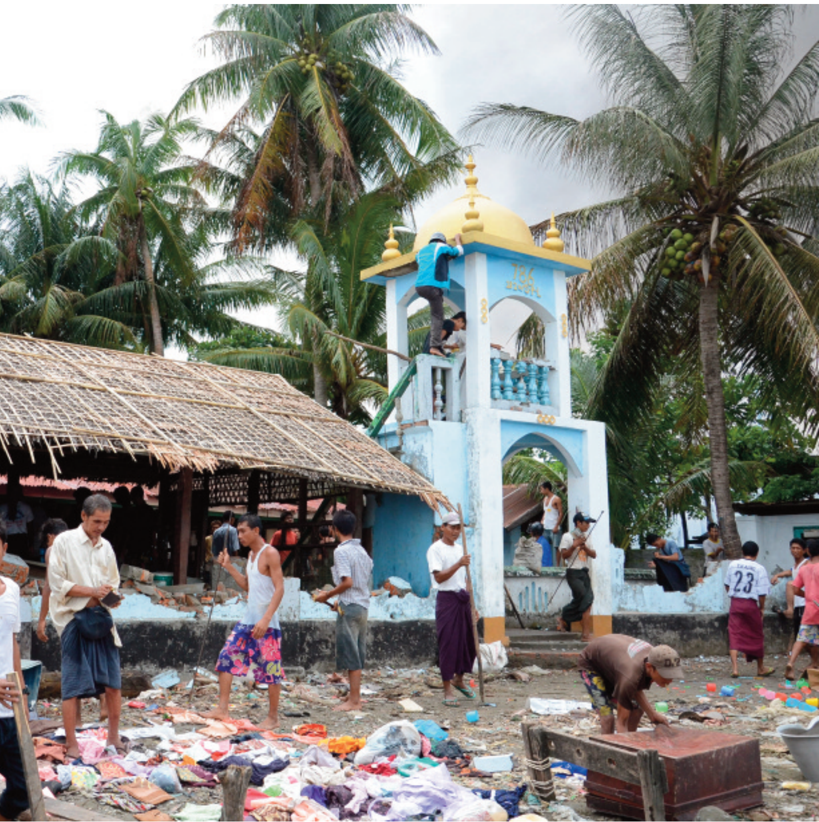
Local Arakanese dismantle and loot the site of a destroyed mosque in Sittwe, June 2012.