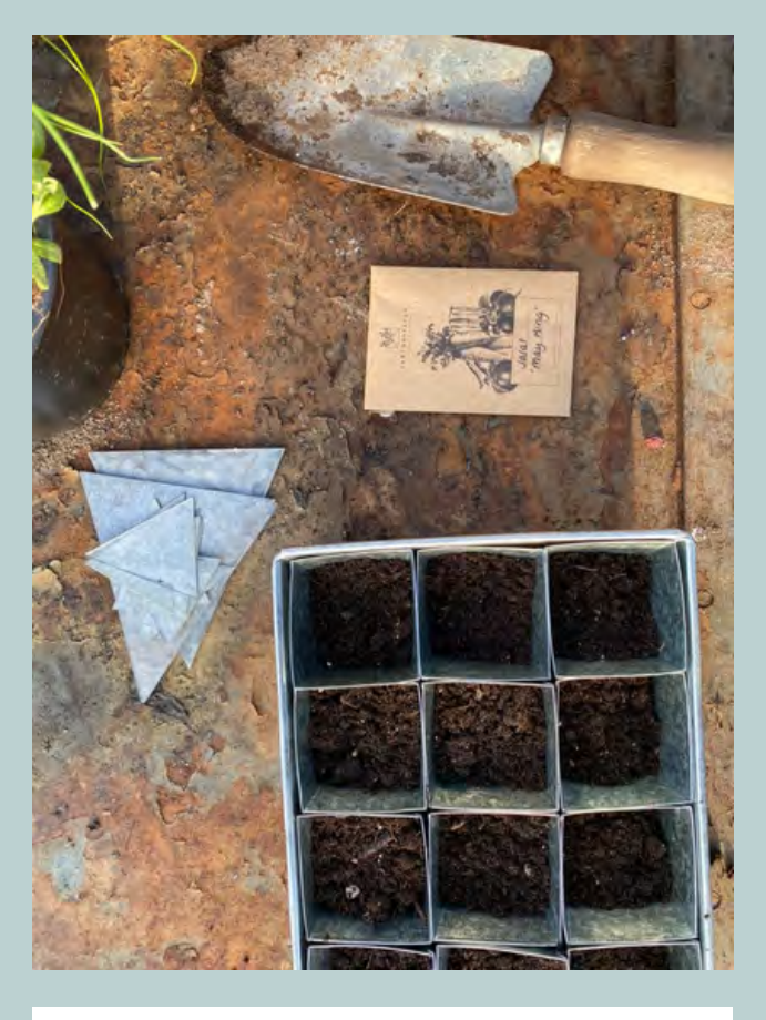
Our "W.E.T. Seed Pot Trays" can be used both indoors and outdoors, and with their rustic and classic look they will fit in to any setting. Regardless whether the seeds and propagations are to be placed at home, in the window or in the greenhouse.