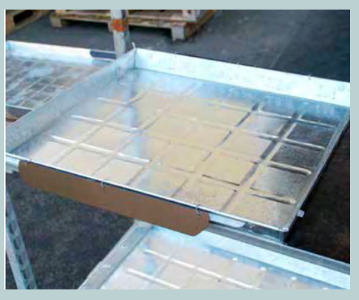
Std. 3 - 40x54x5 cm