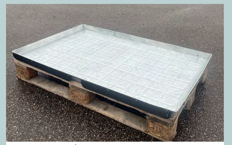
Size: 120x80x5 cm Minimum 5 pcs. per order