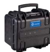
SB 275 External 33 Ah Battery