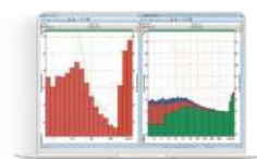
SF 307_3 License of 1/1 & 1/3 octave