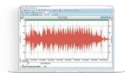
SF 307_15 License of audio recording