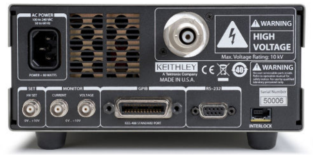
2290-10 rear panel showing the IEEE-488 interface connector, RS-232 interface connector, high voltage output connector, analog control/output connectors, and interlock connector.

The Series 2290's IEEE-488 interface allows the creation of an automated high voltage test system. Software drivers are supplied to simplify and accelerate test system development. This further enhances safety as the high voltage can be controlled from a remote location.