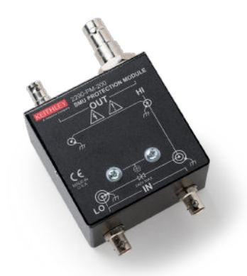
The 2290-PM-200 Protection Module protects low voltage measurement equipment from voltages greater than 200V.

Series 2290 Power Supplies and a 2290-PM-200 SMU Protection Module protect both user and instrumentation from hazardous voltages. An interlock circuit built into the power supplies can be used to ensure that the output voltage is disabled if a high voltage test fixture access door is open. In addition, all Series 2290 power supplies have low voltage analog outputs to permit safe monitoring of the high voltage and the output current.