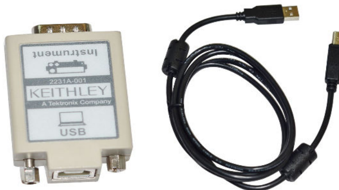
Figure 1: Model 2231A-001 USB Adapter

To set up the remote communication through the Model 2231A-001, configure the computer as follows: