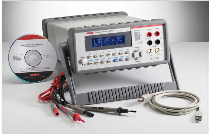
All accessories, such as start-up software, USB cable, power cable, and safety test leads, are included with the 2110.

LabView, IVI-C, and IVI-COM drivers are also supplied to allow for increased flexibility in integrating the 2110 into new and existing systems and test routines.