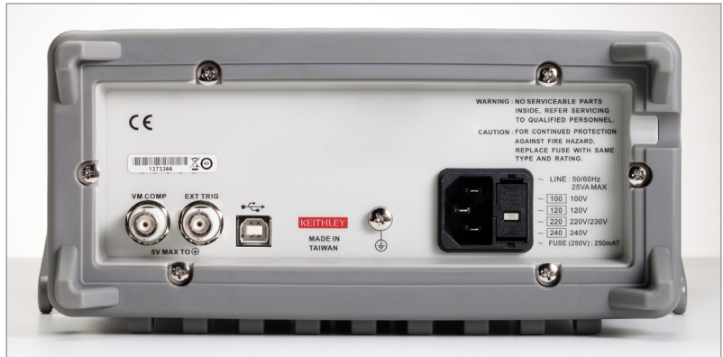
2110 rear panel.