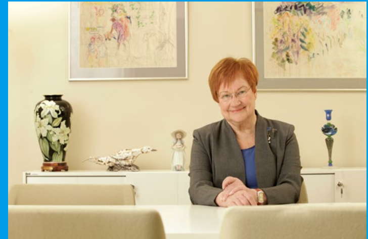
Chair of the Council, the former President of Finland Mrs Tarja Halonen

is a society in which Sivistys is part of our everyday life in order to take care of each other and the environment.