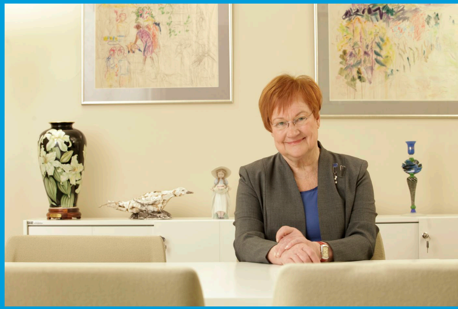
President Tarja Halonen