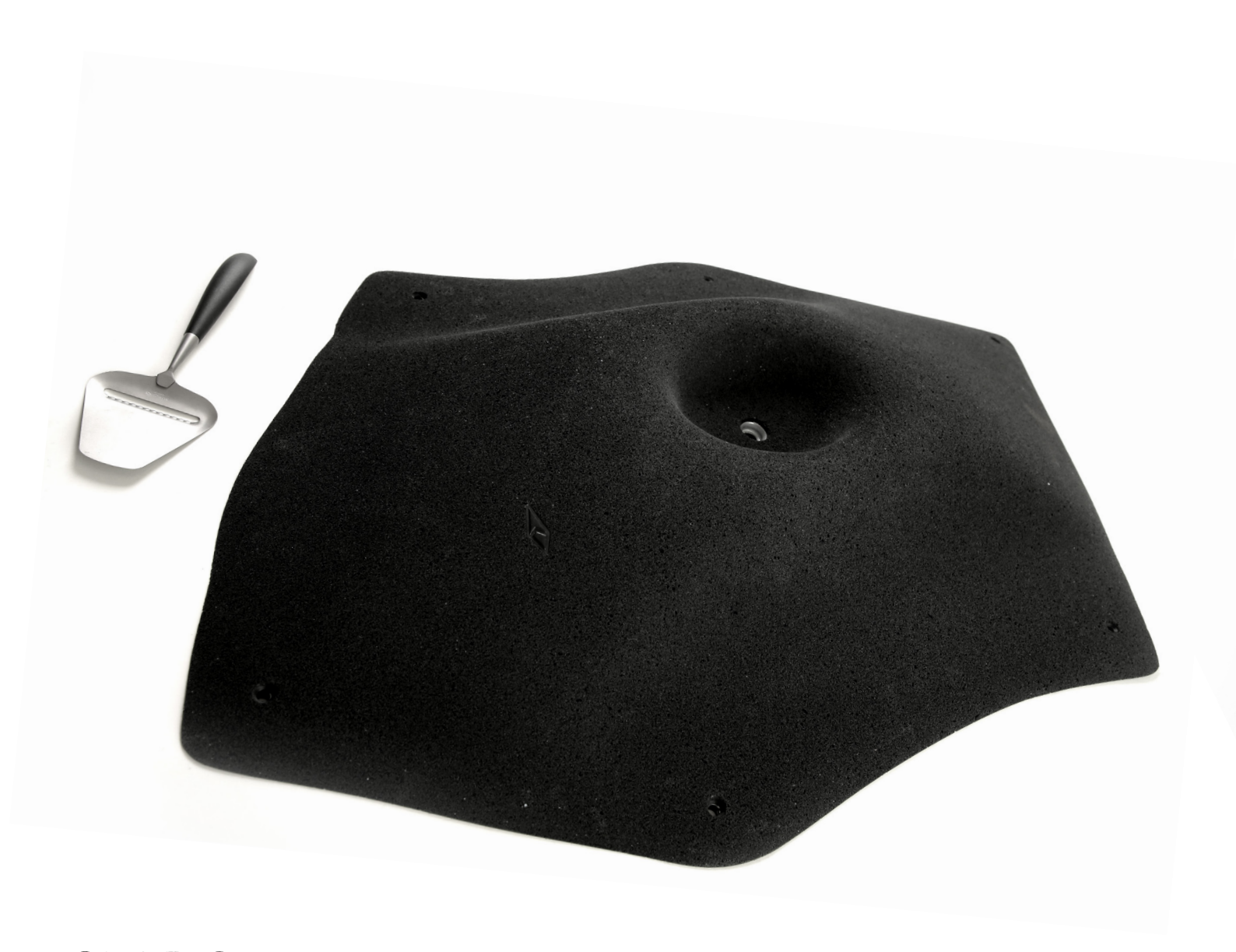
SLAB 3 QTY - 1 Size – XXL Fix – Screw/Bolt Difficulty - Hard