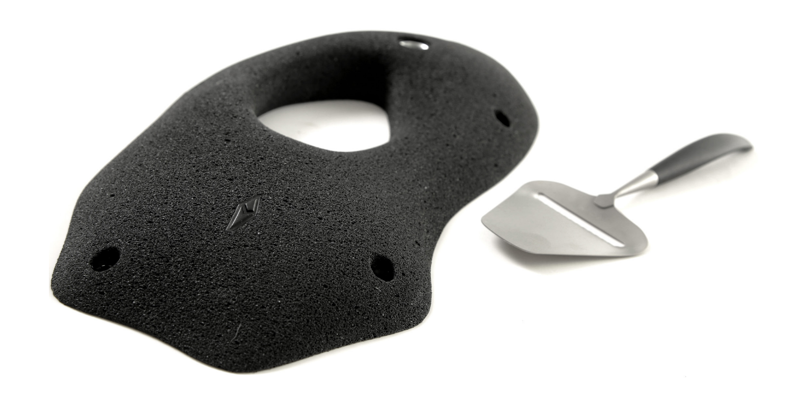
FRIED EGG 1 QTY - 1 Size - M Fix - Screw/Bolt Difficulty - Easy