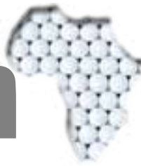
Table Tennis Africa is a quarterly publication of African Table Tennis Federation