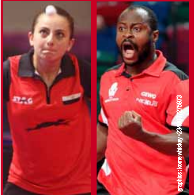
graphics : home whiskey +234 810 775973