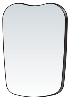
Adult Occlusal L:95mm, W:67mm