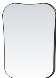
Child Occlusal L:81mm, W:54mm