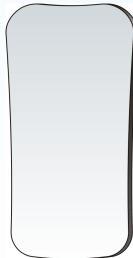
XL Occlusal L:131mm, W:66mm