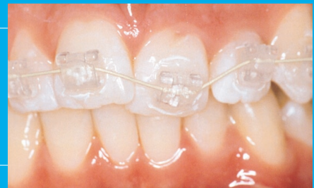
Imagination with Oyster ESL 2.0 brackets