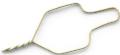
Coated ligatures IM-CL-12

* MBT is a registered trademark by 3M/Unitek.