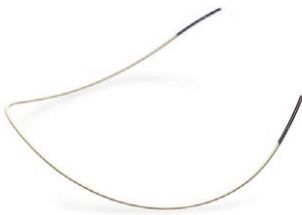
Reverse curve of spee