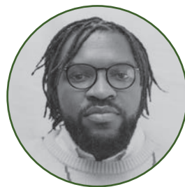
Itati Dzekedzeke Oemph Media