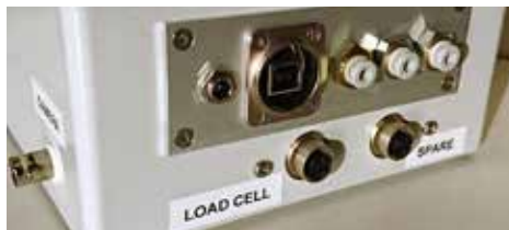
Optional output and inputs configurable according to customer needs.