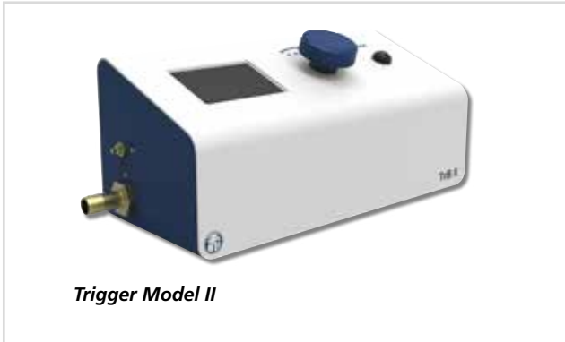
Trigger Model II