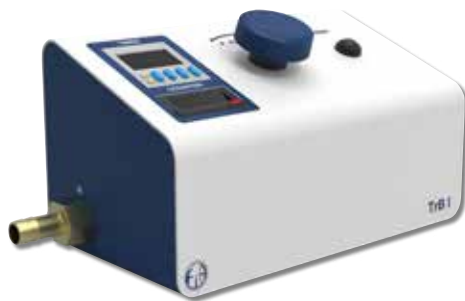
Trigger Model I

Typical usages are for delivered dose uniformity and aerodynamic particle size distribution testing. The products have been designed from both the user and regulatory perspective, why the equipment is compact and user-friendly but still complies with the European Pharmacopoeia and the US Pharmacopoeia. Acknowledging a lab set up may become crowded with lots of tubing and electrical cords, FIA's range of equipment minimises the number of units the analyst needs to handle on the bench.