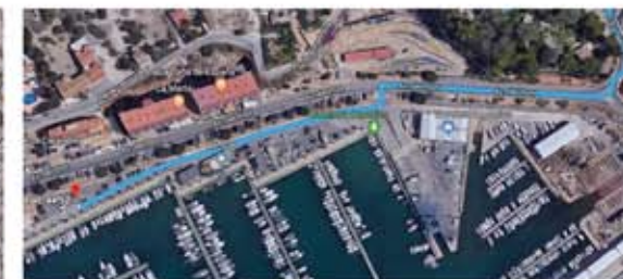
Google Maps: Motorway- CN La Vila