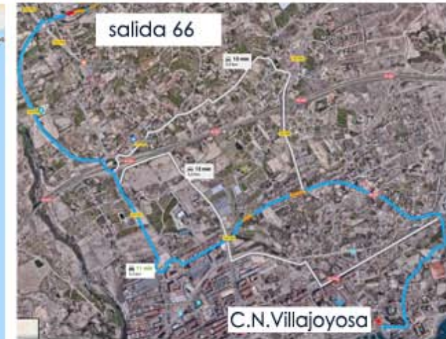
Entrance Club Nautico Villajoyosa