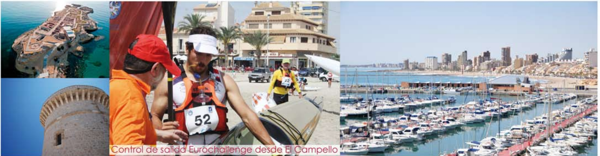
Control de salida Eurochallenge desde El Campello

It is the town of the province with more kilometers of coastline and its beaches are sandy, being the most famous those of Muchavista and Carrer la Mar