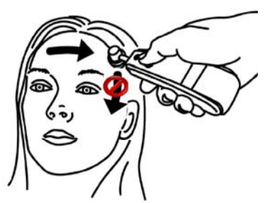
3 Slide STRAIGHT across forehead, NOT down the side of the face