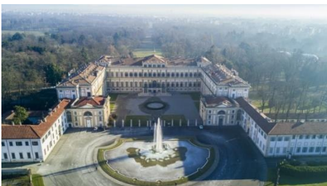
Monza, Villa Reale

- Como and the Lake : little more than 30 minutes from Milan, heart-stopping Lake Como offers some truly evocative scenery. Jump aboard one of the traditional ferries in order to reach the nearby town of Bellagio, visit the historic Villa Melzi, a Neo-classical-style residence surrounded by a botanical garden overlooking the lake. The town of Como is also a must-see with its picturesque alleyways and gastronomic specialties. Find out more here .