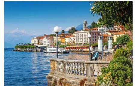
Como Lake, Bellagio