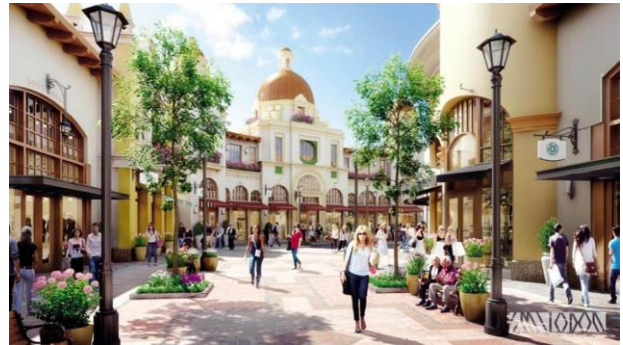
Fidenza Outlet Village: a shopping heaven 1 hour from Milan