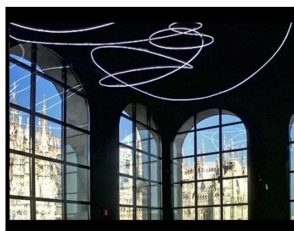
Museum of 20th Century Art