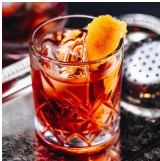
Negroni is the traditional aperitivo in Milan

And what about a last glass of wine before bedtime? Milan offers a wide range of wine cafes: Signorvino and La Cantina di Franco are among the best.