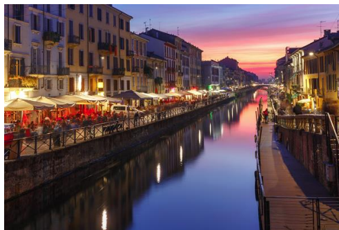
The Navigli area with its cafes and restaurants