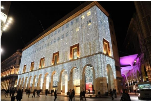
La Rinascente, the first department store in Milan

- Il Salvagente is a small fashion outlet not far from Milan city center, just a few minutes from Linate Airport. Find out more here .