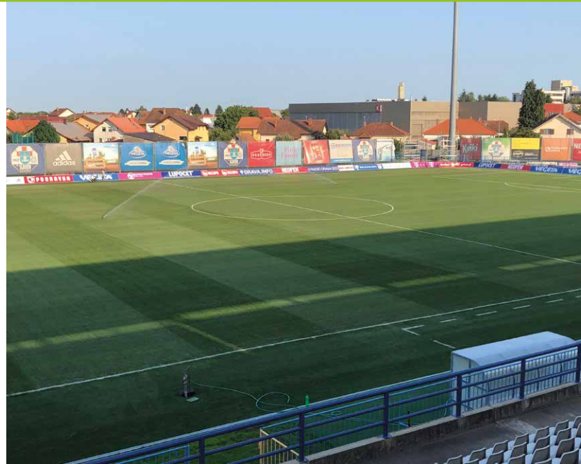
Slaven Belupo FC Koprivnica - CROATIA

Great feedback was testified by players and trainers.