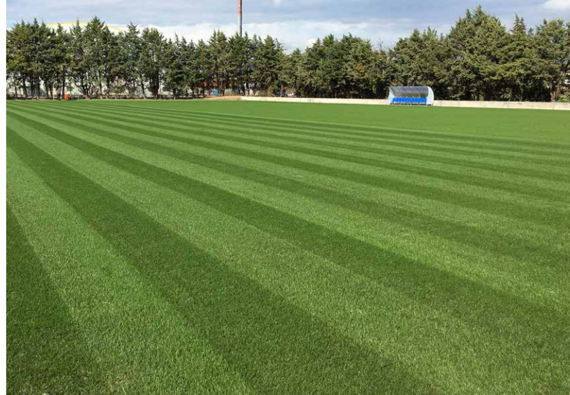
ASD Saurorispesca Via Adda - Grosseto - ITALY