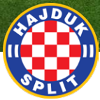
Hajduk Split FC Split - CROATIA

The playing area of the training pitch of Hajduk Split FC has been successfully installed during the summer 2018, while our contractors were installing the stadiums of Inter Zapresic FC and Slaven Belupo FC