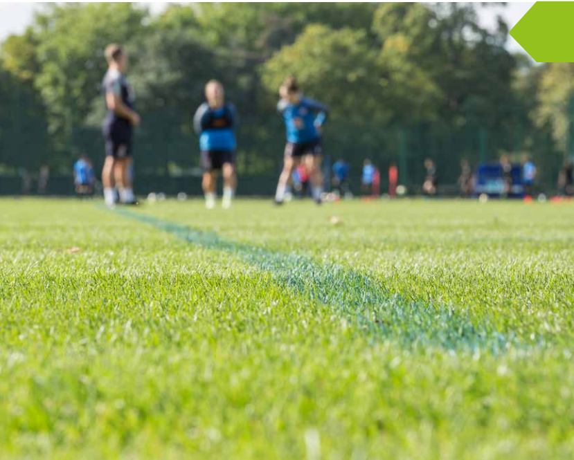
Bisham Abbey National Sports Centre Marlow - U.K.