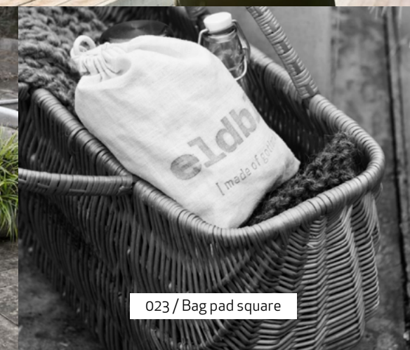
023 / Bag pad square