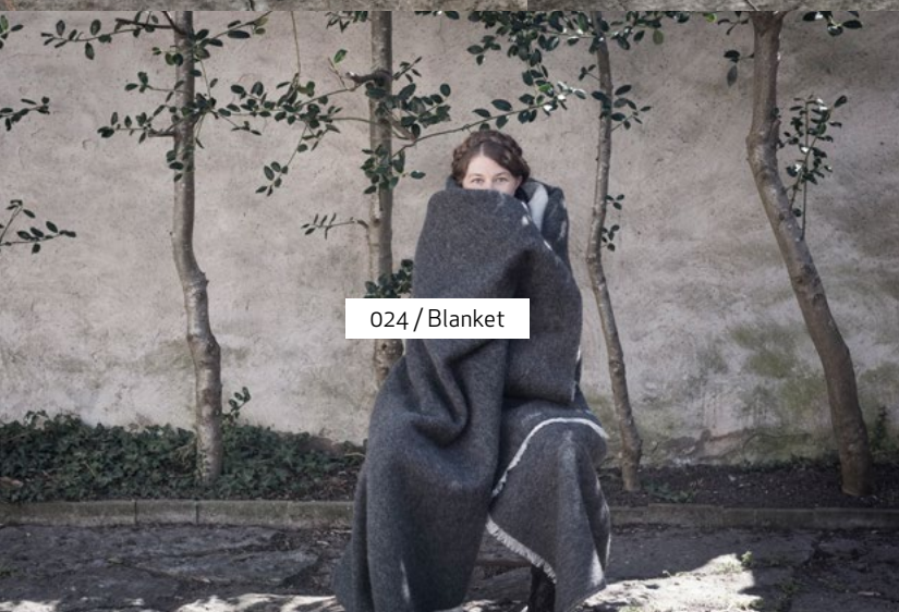
024 / Blanket