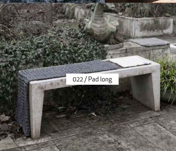
022 / Pad long