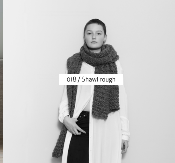
018 / Shawl rough