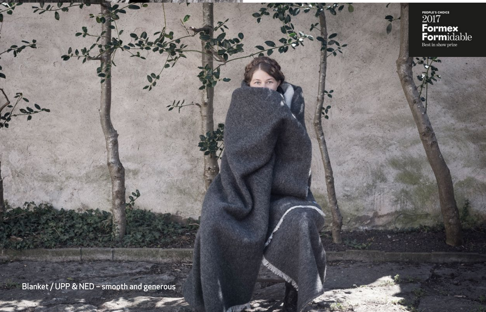
Blanket / UPP & NED – smooth and generous

The blanket gives a smooth and cherishing experience with its structure and quality. It is generously cut, each side a block of one colour, with delicate fringes on two sides. Winner of the Formex Formidable People's Prize 2017.