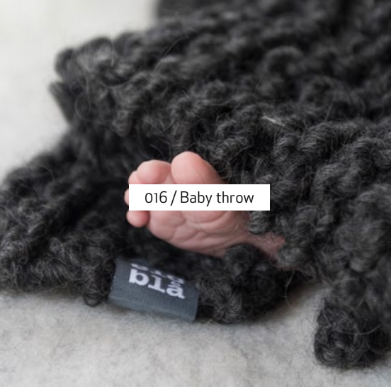
016 / Baby throw