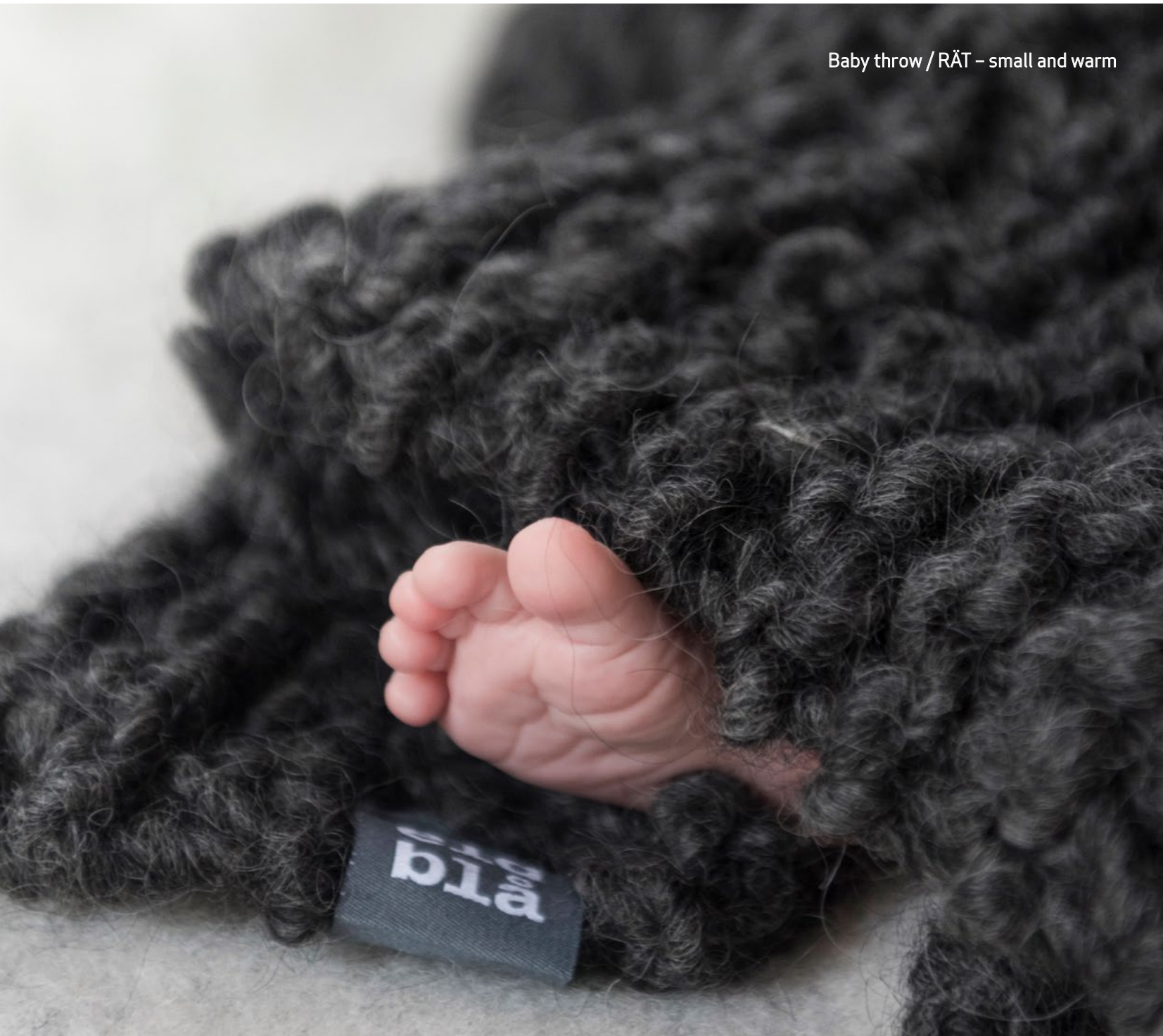
Baby throw / RÄT – small and warm

The characteristics of the wool is what interest us. The structures of the knitted material, each mesh and its density creates different structures that shapes each product. This, together with the natural colours of the wool and its luster and how the light works on these surfaces, is what we look for. Whether it's a voluminous shape of a blanket being used, a throw wrapped around someone or a silhouette of a shawl being worn – the qualities of the material and the simplicity of the straight stitch is always there.