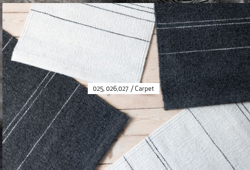
025, 026, 027 / Carpet