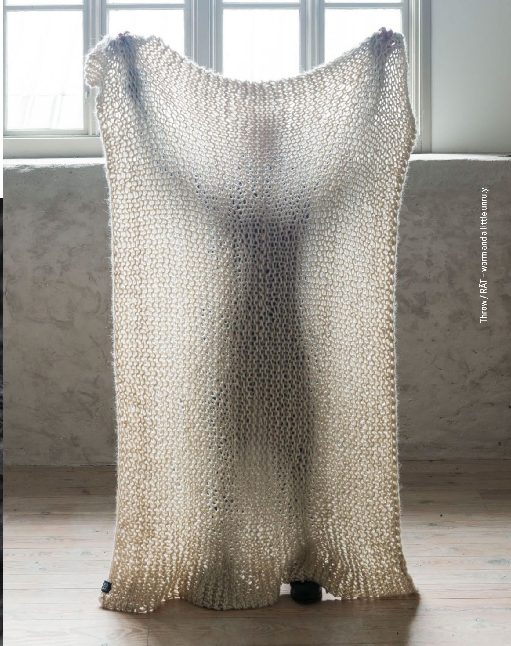
Throw / RÄT – warm and a little unruly