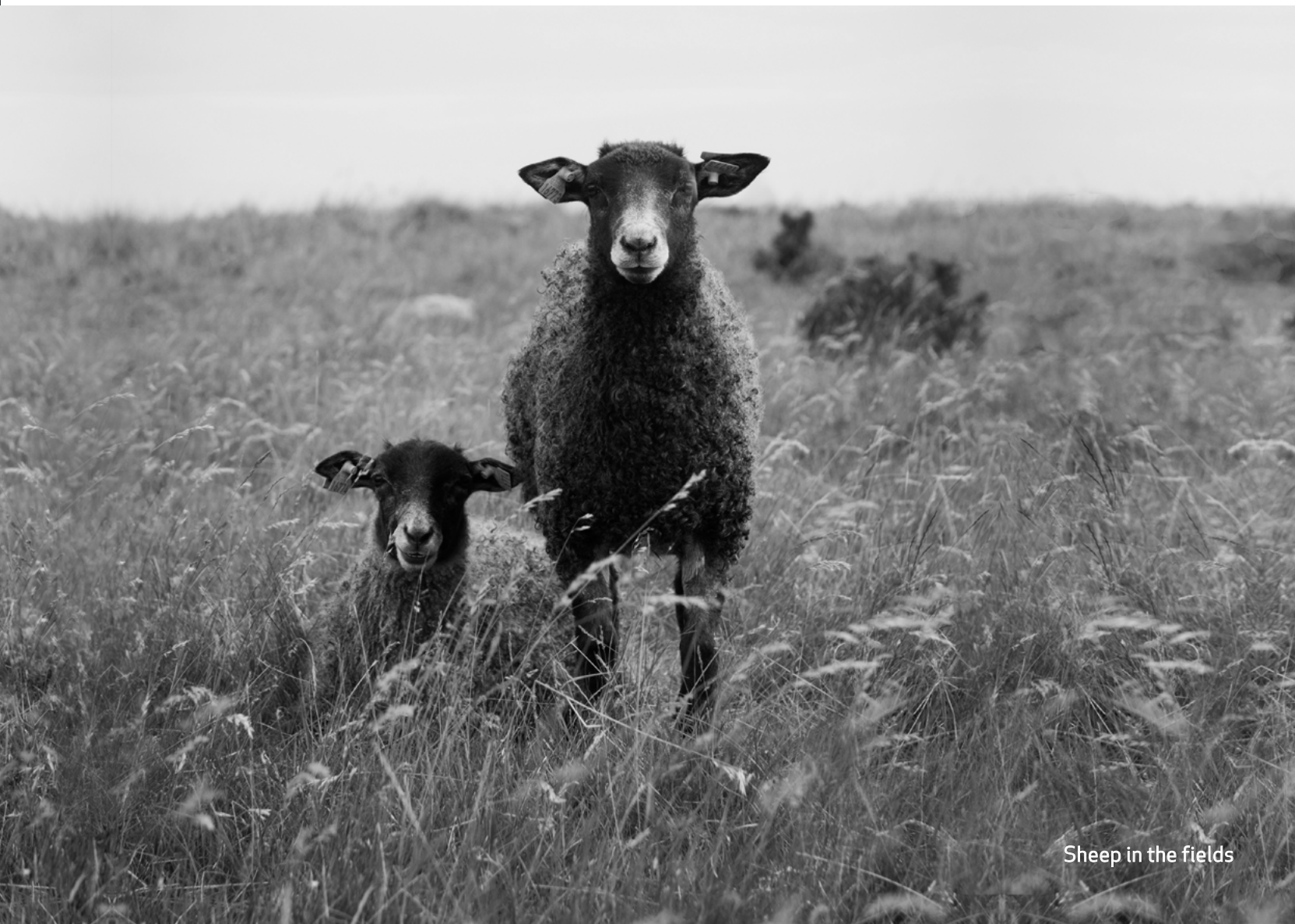
Sheep in the fields

Wool has a number of fantastic material qualities – it's renewable, moistureproof and has flame retardant properties. The grey Gotlandic wool is unique with its long silver grey soft shiny curls. Our wool is cut twice a year and spun at a local spinners on Gotland to a yarn quality needed for our products. The grey shades come from the Gotland Pelt whereas the white wool is Leicester and Swedish fine wool – the sheep all grazing the Gotland pastures.