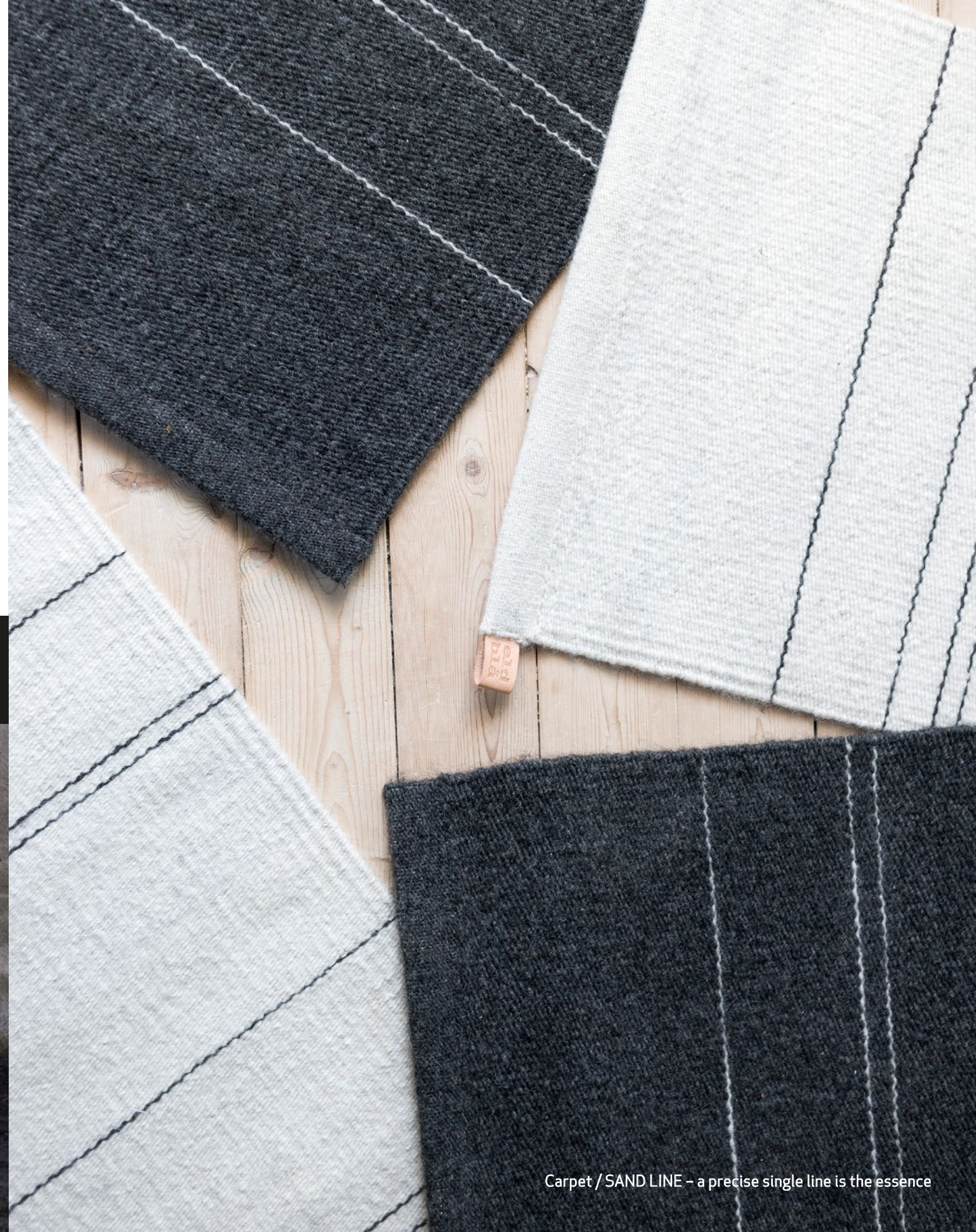
Carpet / SAND LINE – a precise single line is the essence