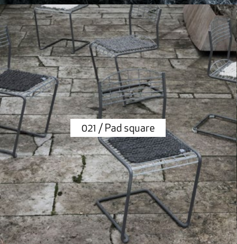
021 / Pad square