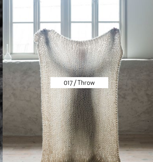
017 / Throw