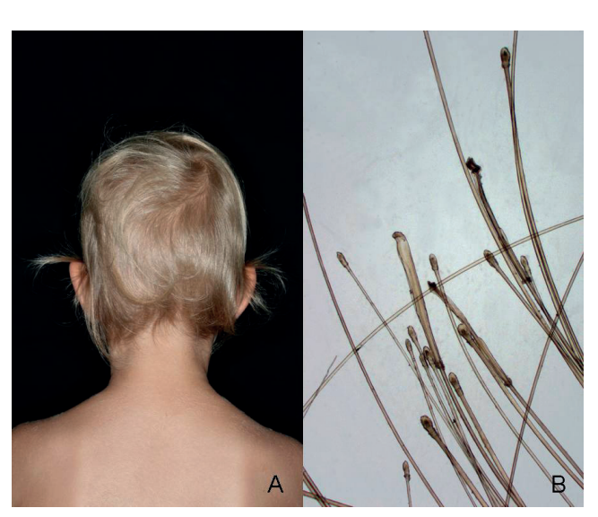
Fig. 1. The girl at the age of 5 years with sparse, fine blond hair (a) with a characteristic telogen hair root pattern in the trichogram (b) with up to 70% telogen hairs (normal rate < 20%).

At 9-years of age, the patient presented for a follow-up visit with continued hair growth abnormalities. Conspicuously, only the central maxillary incisors had presented (Fig. 2a). The intraoral examination revealed complete primary dentition; the orthopantomogram (OPG) (Fig. 2b)