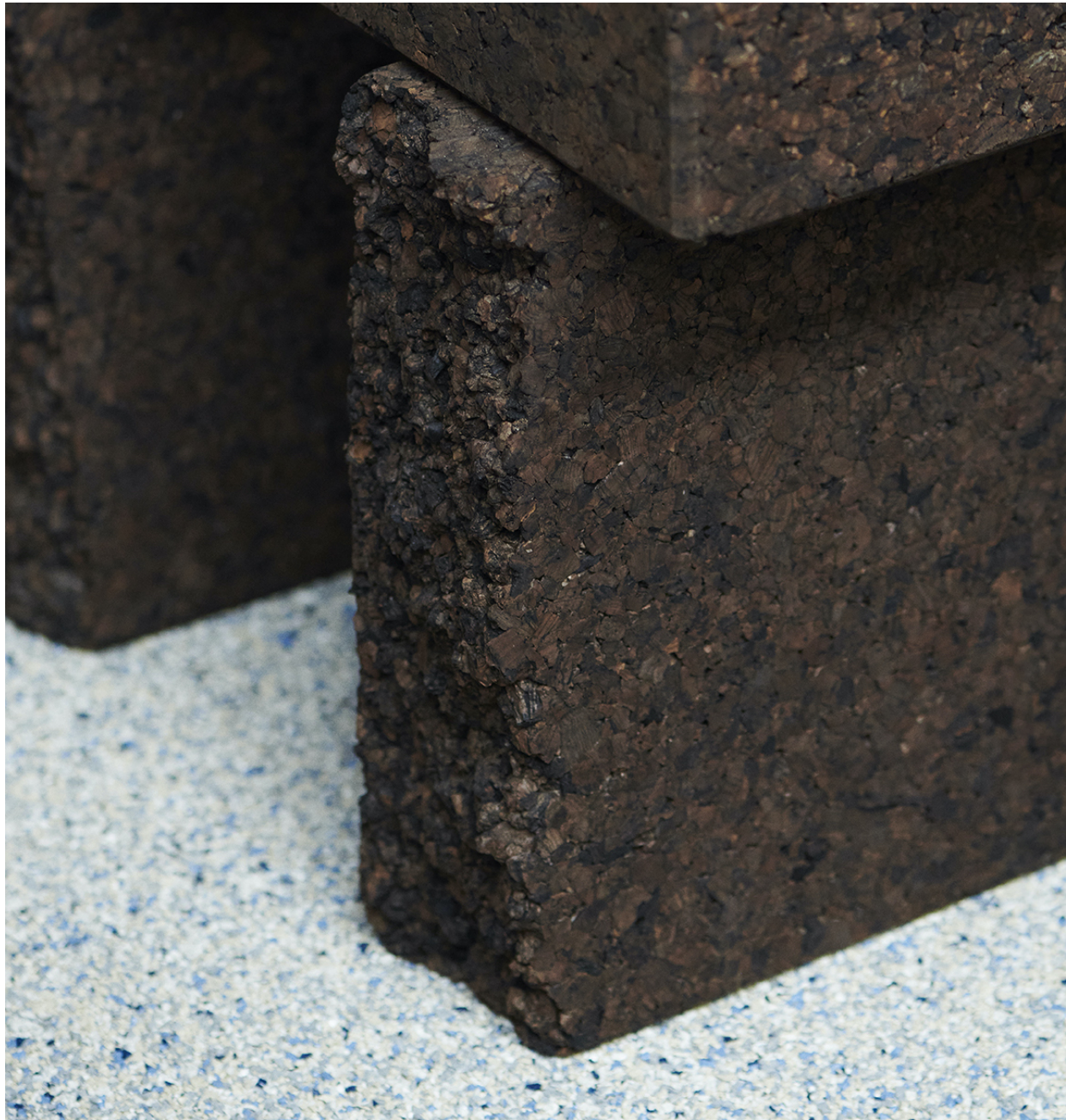
Soft Works by Carsten in der Elst at Tableau