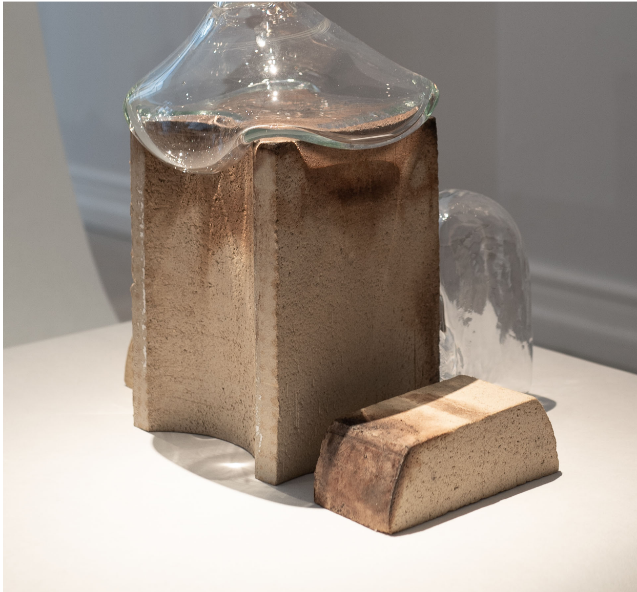
STACKS - spatial sentences by exhibit studio at Officinet, Copenhagen

'STACKS - spatial sentences is a series, 'an alphabet', of objects in ceramics and glass. The alphabet works as a design tool to enhance and explore how the objects have the ability to speak and shape the exhibition