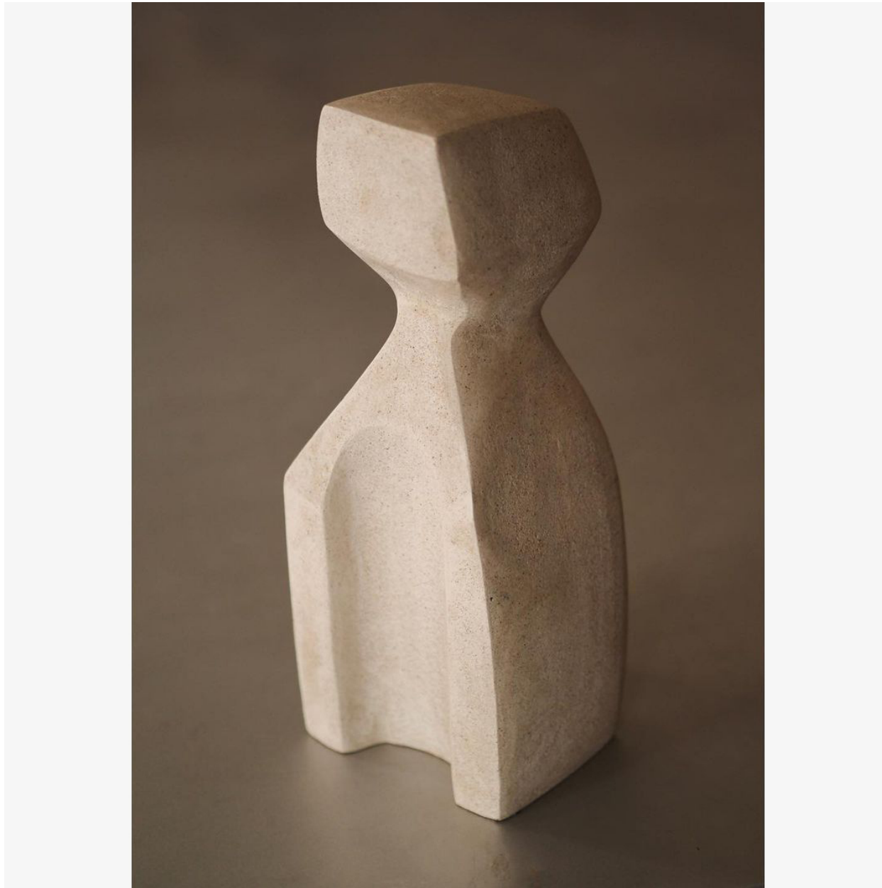
Between Words by Josefine Winding at New Mags