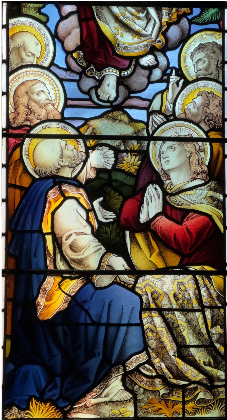
Figure 1 Photo taken by Stephen Hutchinson

Another beautiful stained glass window from Pulford Church. The attention to detail by the artist who designed and implemented these windows is breathtaking.