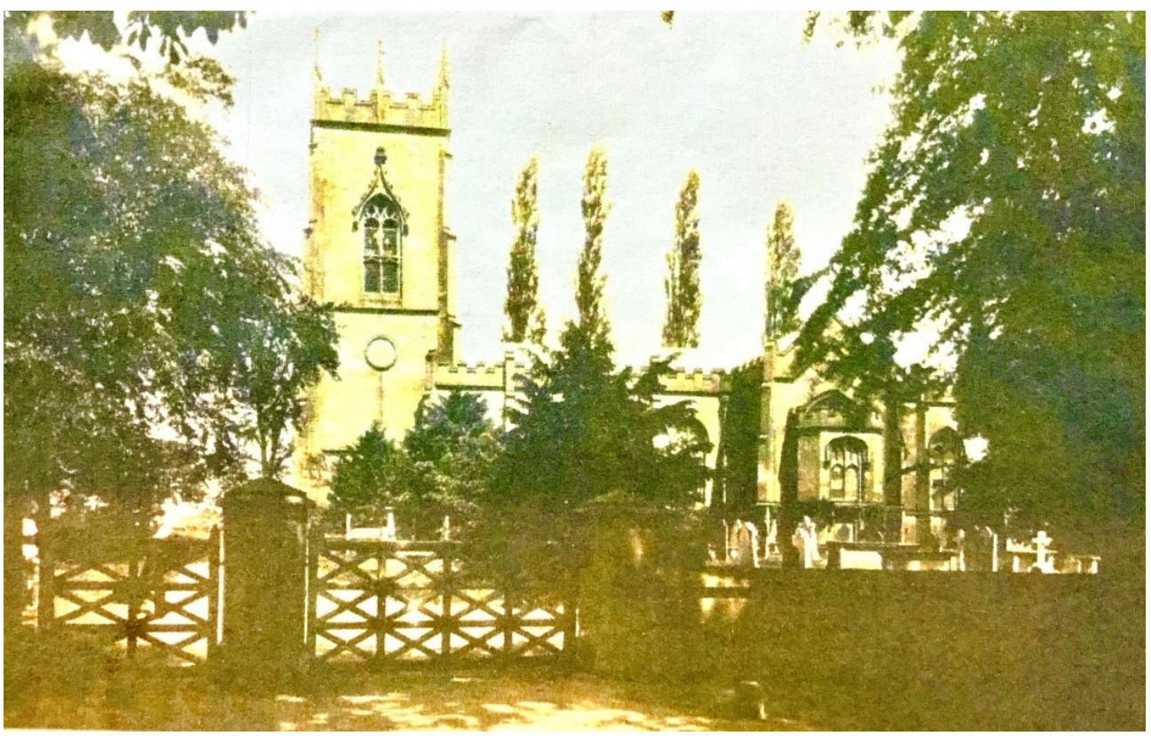
Figure 1 Old Eccleston Church 1888