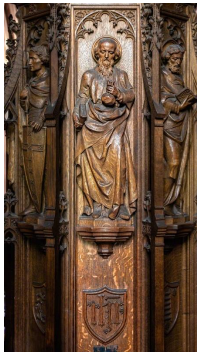
Figure 1- St Matthew (Font at Eccleston Church)