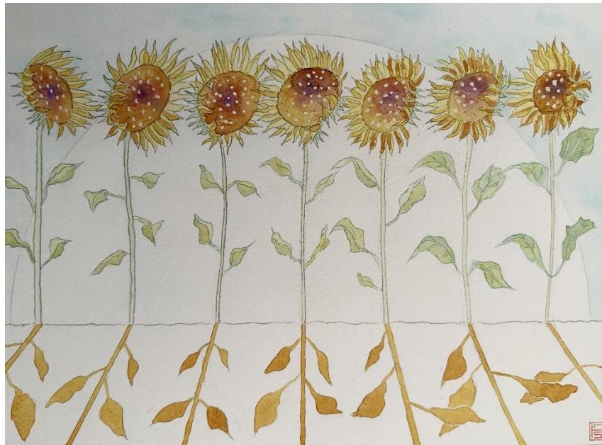
Figure 1- Seven Sunflowers