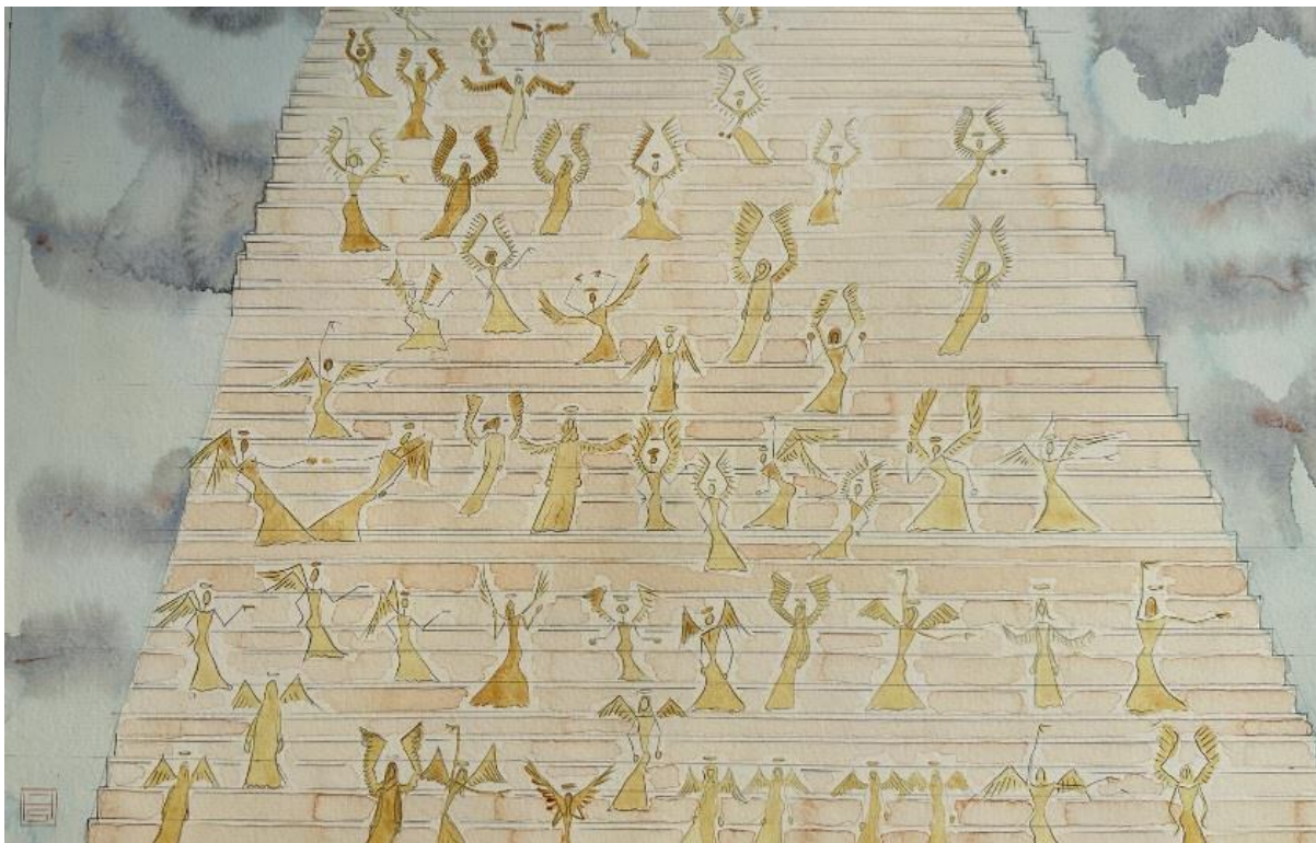
Figure 1- Jacob's Ladder