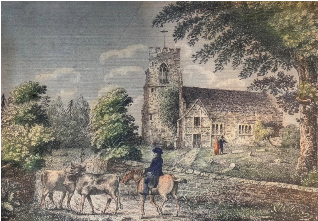
Figure 1 Eccleston Church 1800