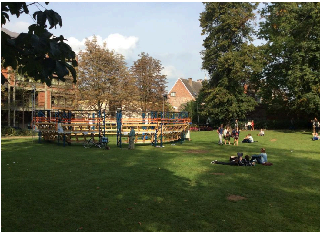
STUK start, Stadspark Leuven, BE