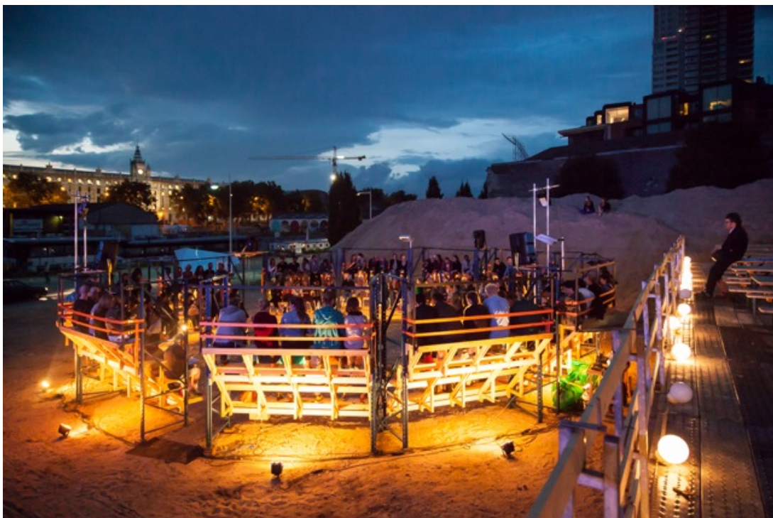
Festival Kanal, BE