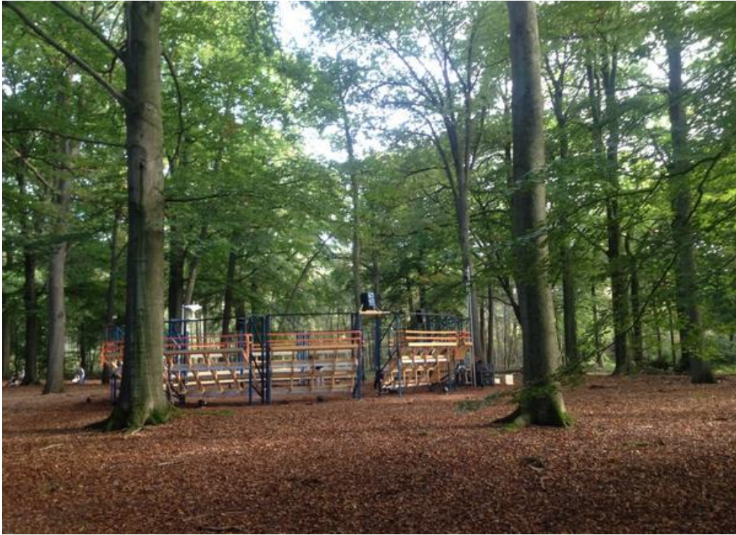
Prinsenpark, Retie, BE