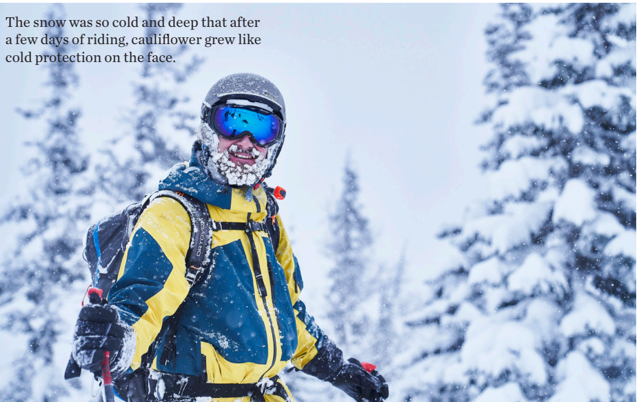
The snow was so cold and deep that after a few days of riding, cauliflower grew like cold protection on the face.