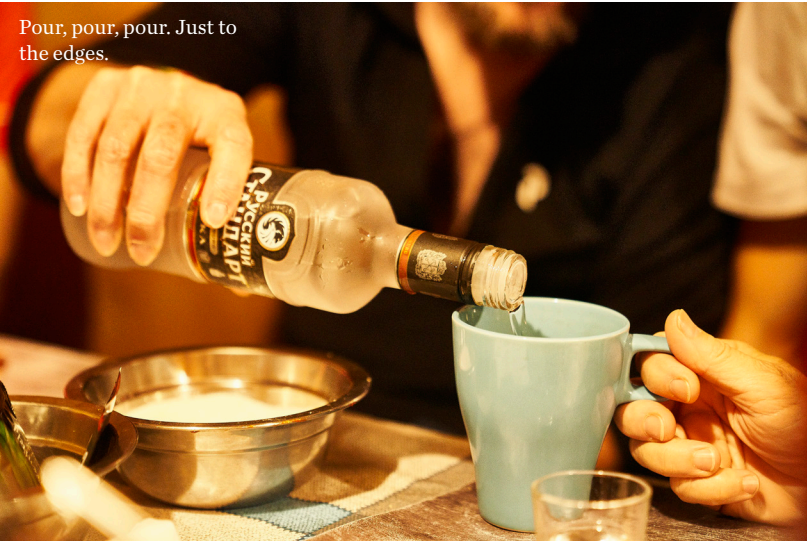
Pour, pour, pour. Just to the edges.