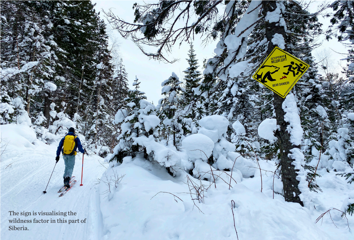
The sign is visualising the wildness factor in this part of Siberia.