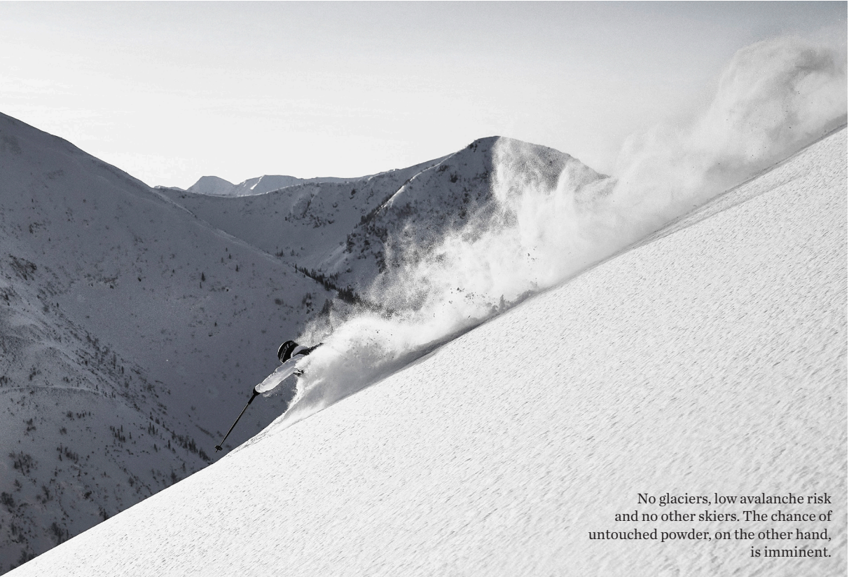
No glaciers, low avalanche risk and no other skiers. The chance of untouched powder, on the other hand, is imminent.

he great hordes of powder-hounds have not yet found their way to the Mamay Valley. It makes sense though since there are no lifts here. There are only a small number of illegally built cabins. Yes, the authorities in Siberia think that the area is so sparsely populated that anyone who wants to has an undocumented right to build a cabin on this state-owned land as long as you don’t litter or cut down too many trees. But as a cabin owner, you cannot claim any ownership whatsoever. But it