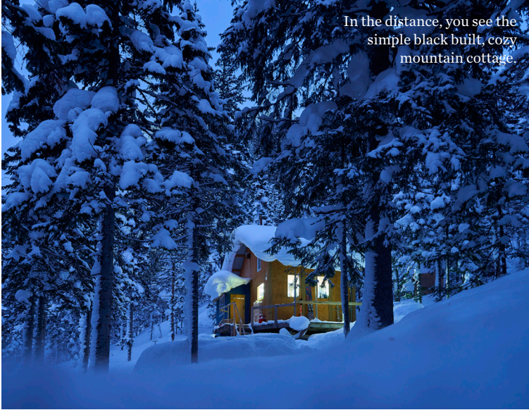
In the distance, you see the simple black built, cozy mountain cottage.