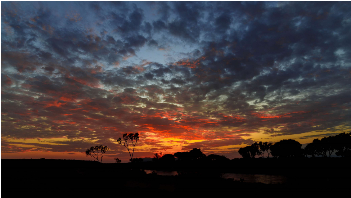
"Samburu Sunset", Samburu National Park, 18th July 2021