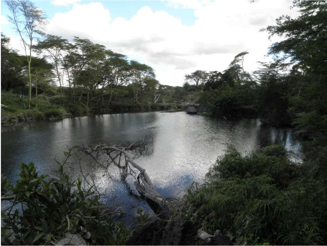
"Mzima Springs" Tsavo West National Park

largest privately owned security company with a US$ 3.3 billion in annual turnover in fiscal 2021. The issue is a private issue and only open to institutional and qualified investors.