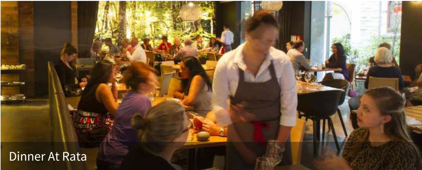
Dinner At Rata

Upon arrival into Queenstown, a private vehicle will transfer you to Amisfield (10 minute drive) to go behind-the-scenes on a private tour including tastings and a 3 course lunch with matching wine pairings. Following lunch, you will be transferred to Eichardt's Private Hotel to check-in for your 3 night stay (20 minute drive).