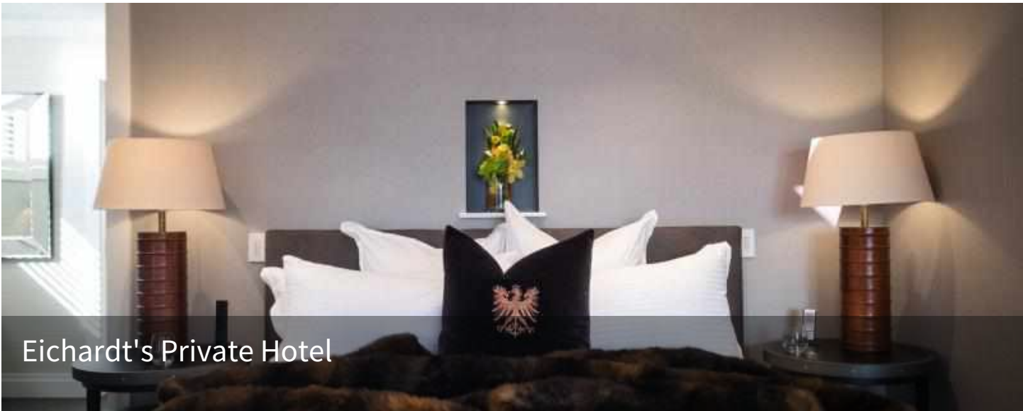
Eichardt's Private Hotel

Just a 250m walk from your hotel, enjoy a la carte dining with a $250 per person allowance included.