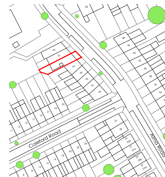
LOCATION PLAN SCALE 1:1250 @ A3

"(c) UKMap Copyright. The GeoInformation Group 2017 Licence No. LANDMLON100003121118"