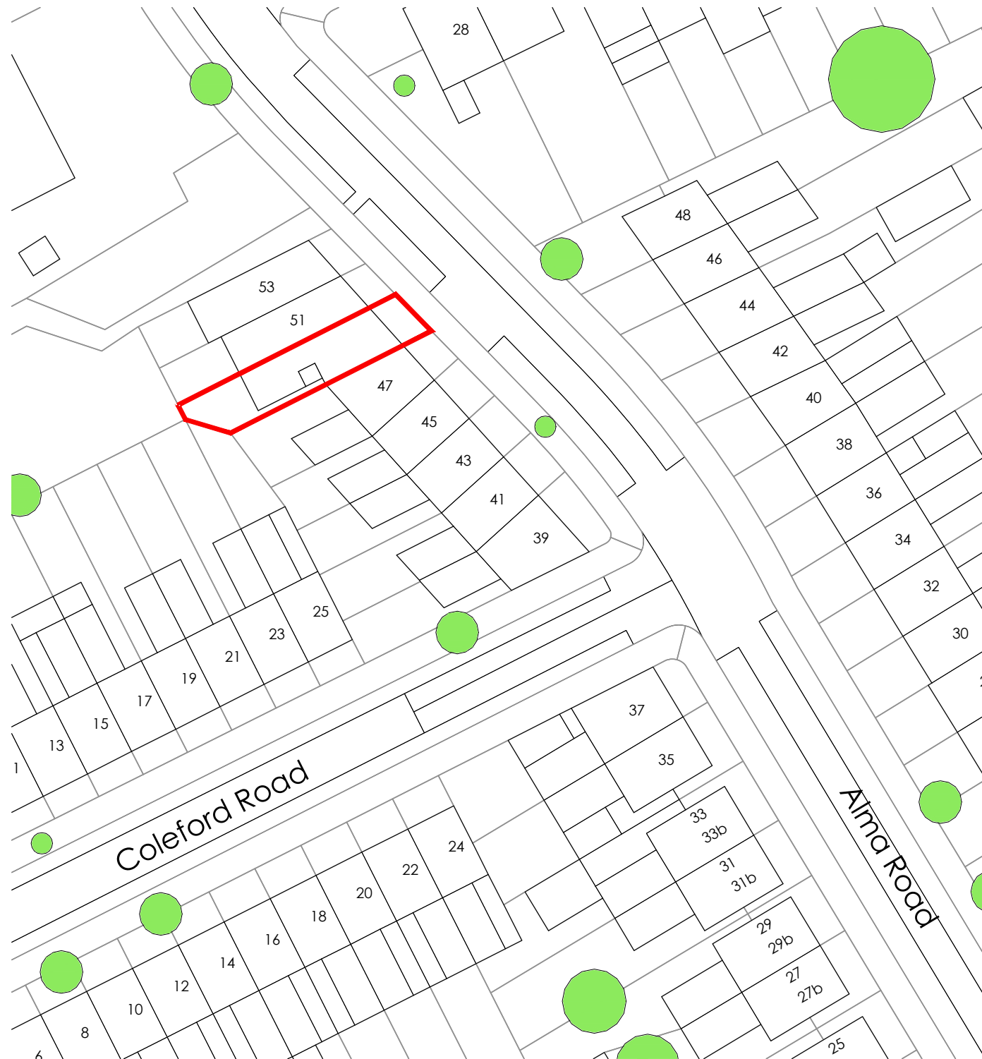
LOCATION PLAN SCALE 1:500 @ A3