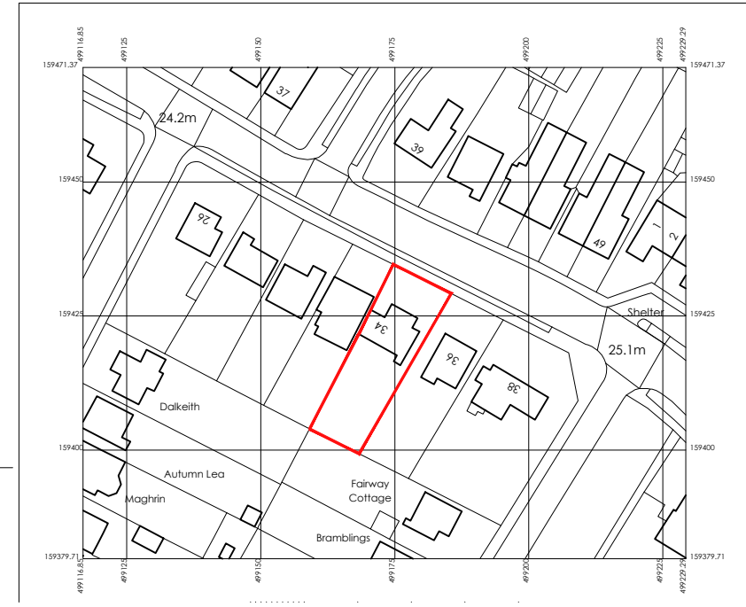
LOCATION PLAN SCALE 1:1250 @ A3